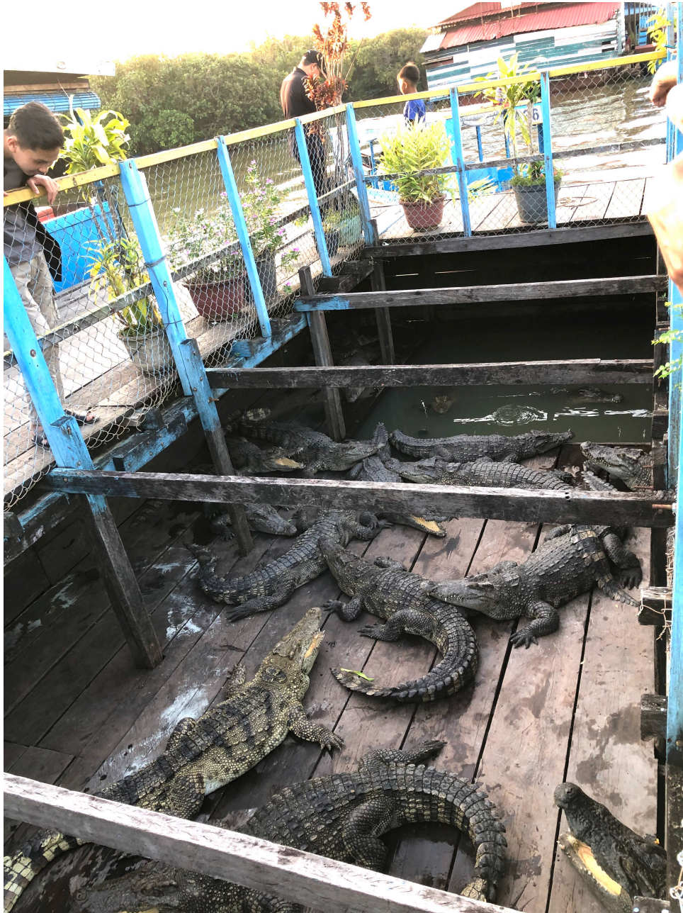
Big crocodiles (not as big as Aussie crocs).