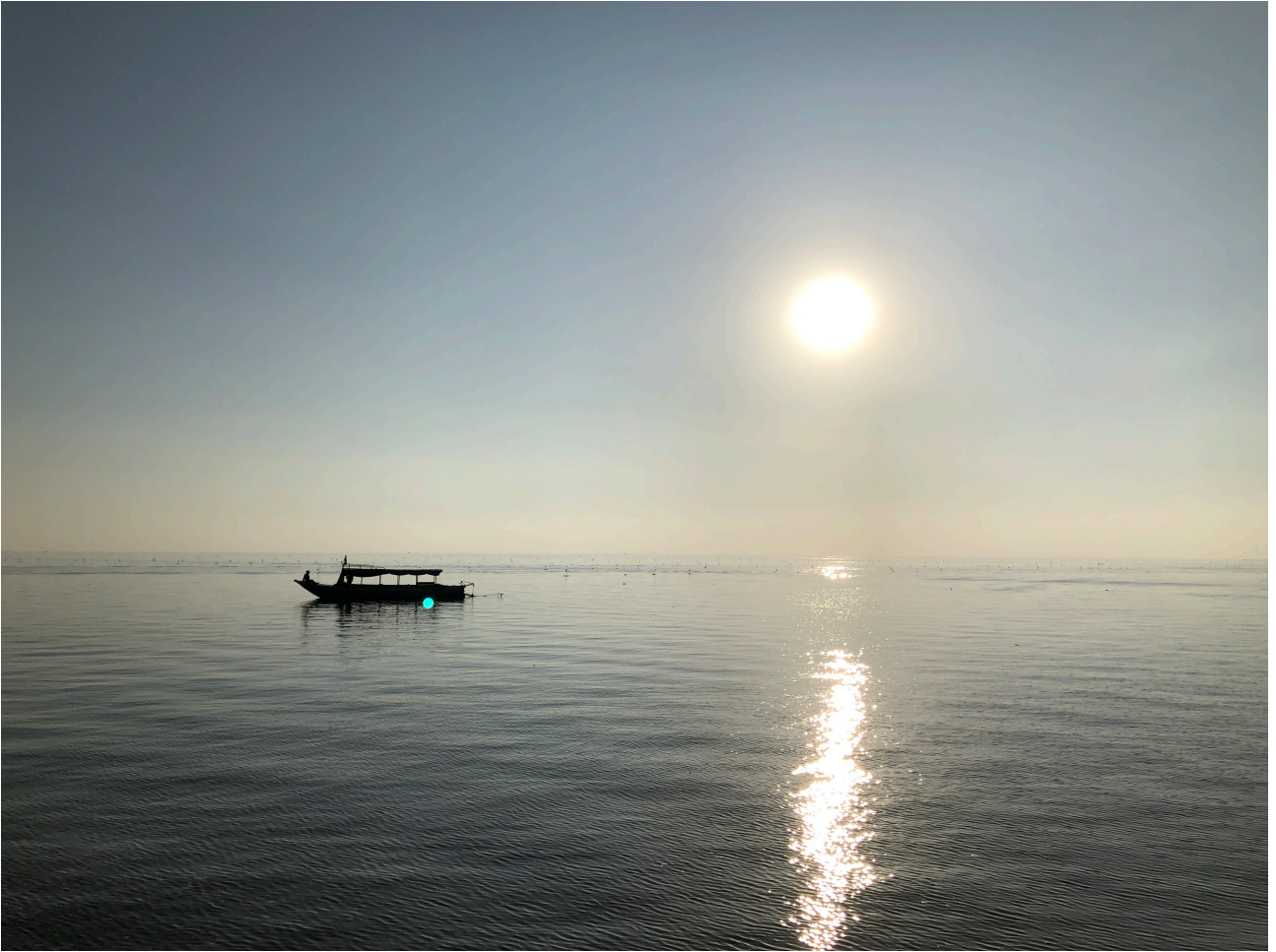
The sun beginning to set.