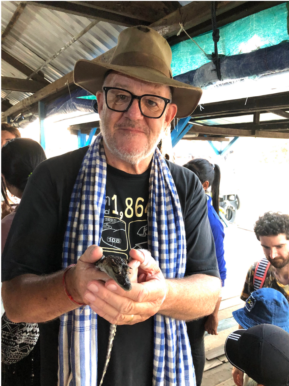
And little crocs.