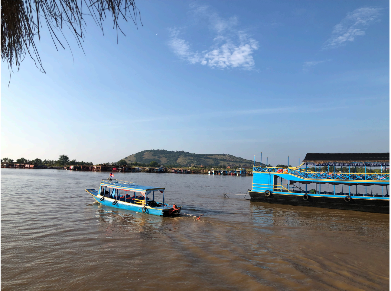
Various boats on Tonle Sap with Phnom Kroam in the background.