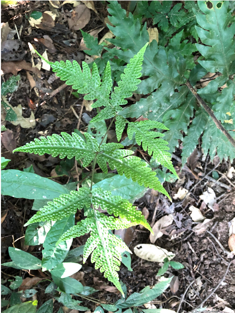
Fern with spores.