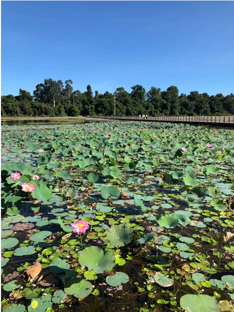
The last of the lotus flowers and the wooden bridge across the East Baray (back to the Grand Circuit Road).