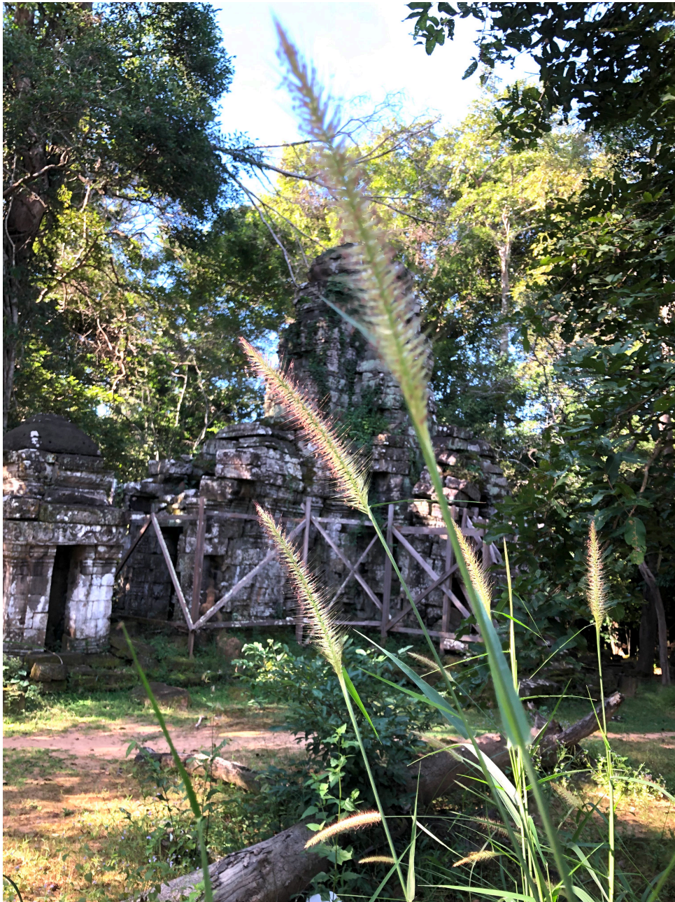
Trees and grass at Prasat Chrung NW.