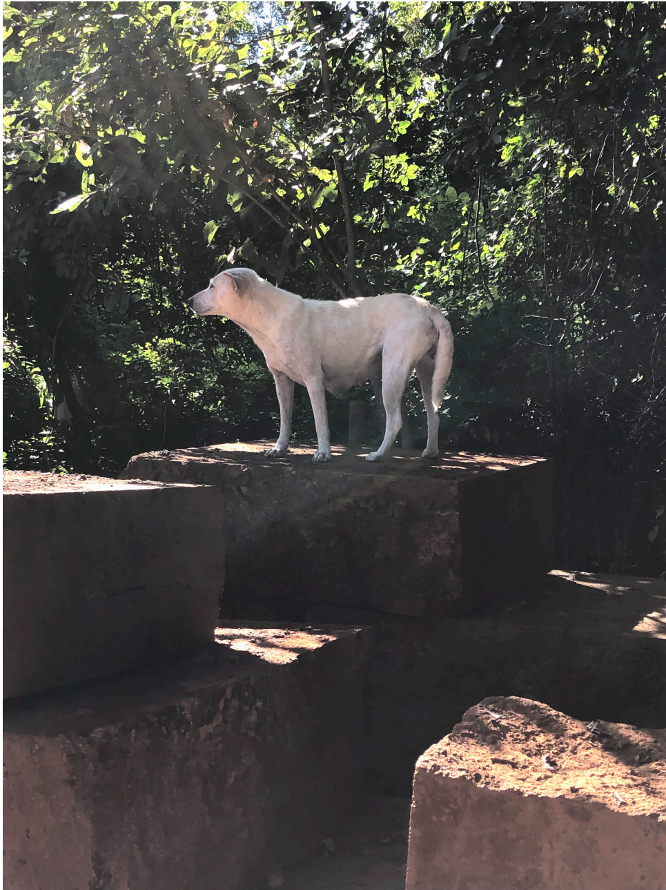
Not quite the dog on the Tuckerbox.

They have begun work on the new road near our apartment... big steam rollers (with not much room for even a motorbike to go around them).