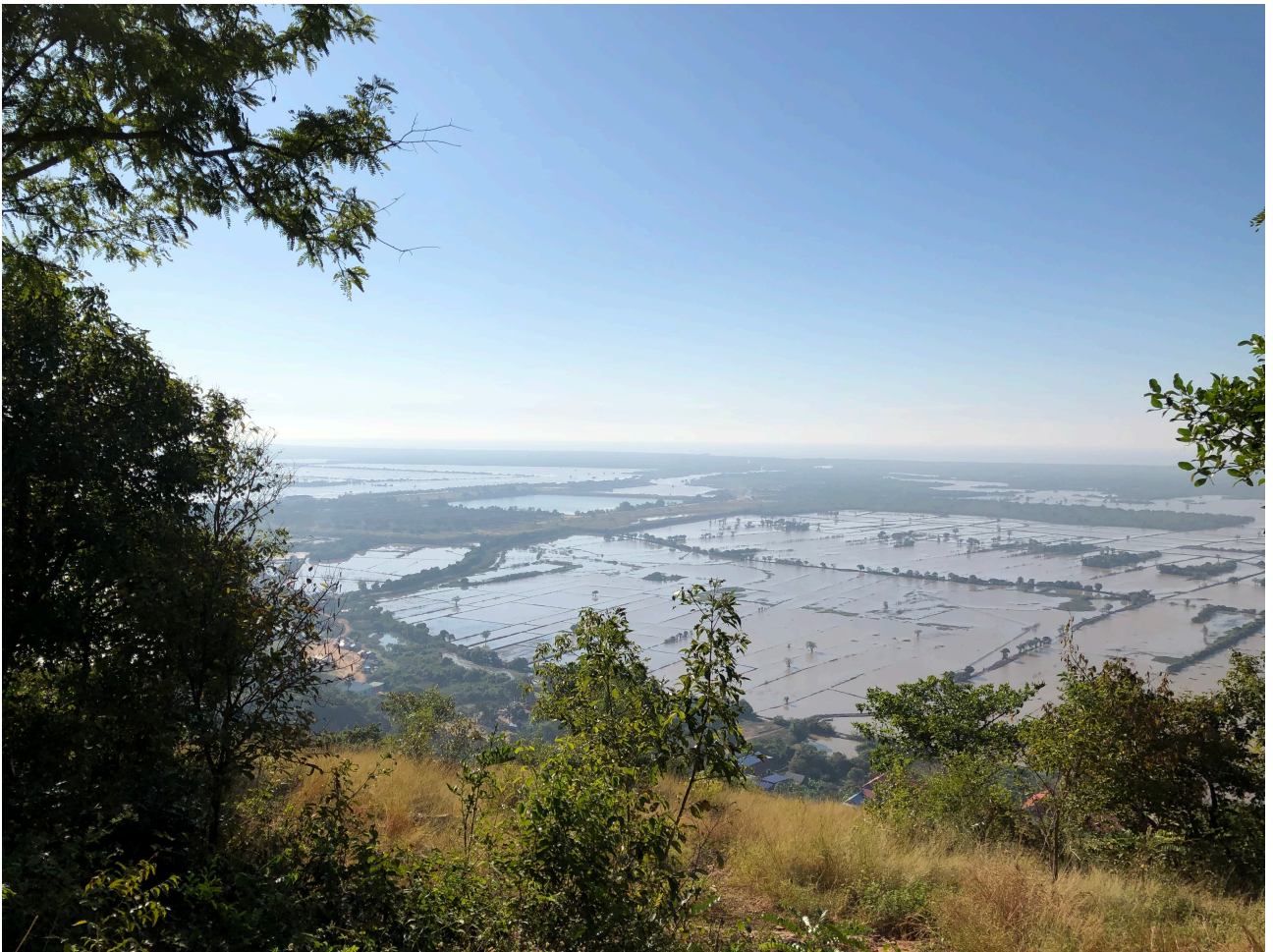
Flooded fields and Tonle Sap on the distance.