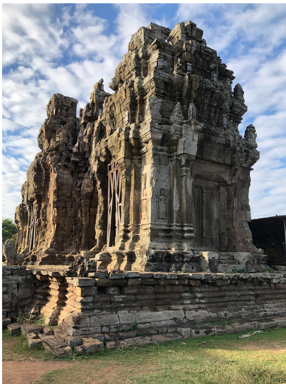
Three towers of Prasat Phnom Krom.

Further up the hill is the Angkorian temple, made of sandstone which has significant erosion (perhaps from winds across Tonle Sap?)