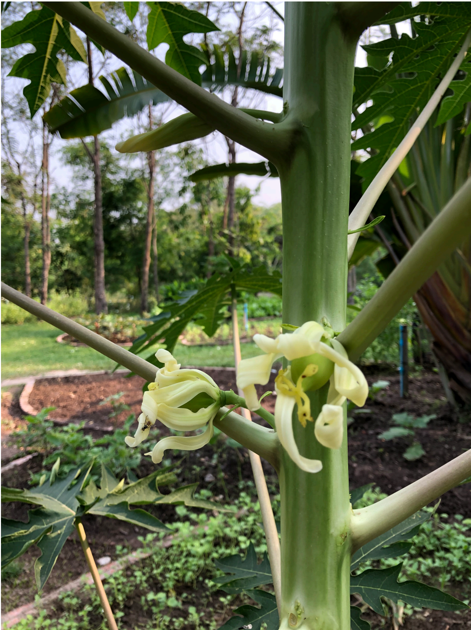
These are papaya flowers.