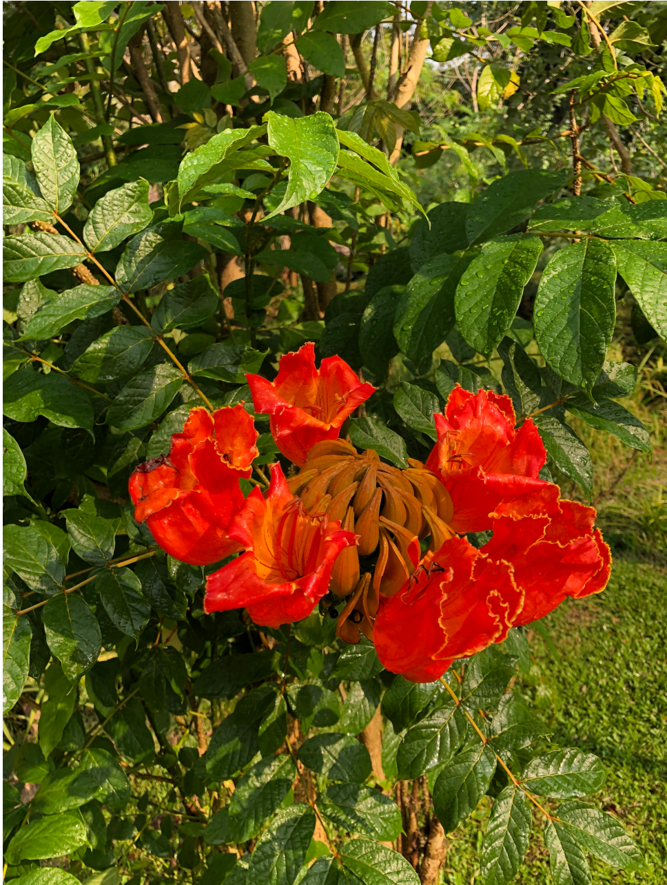
Another bunch of red flowers.