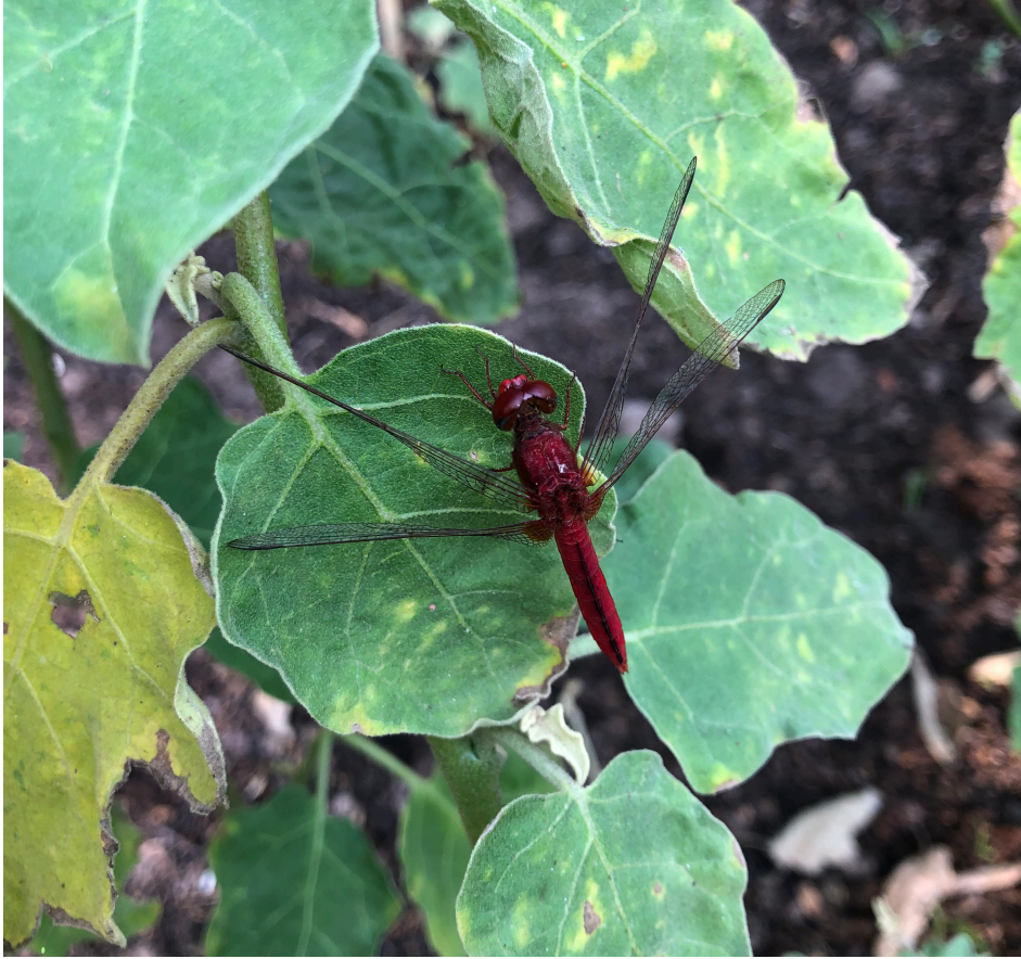
A red dragonfly.