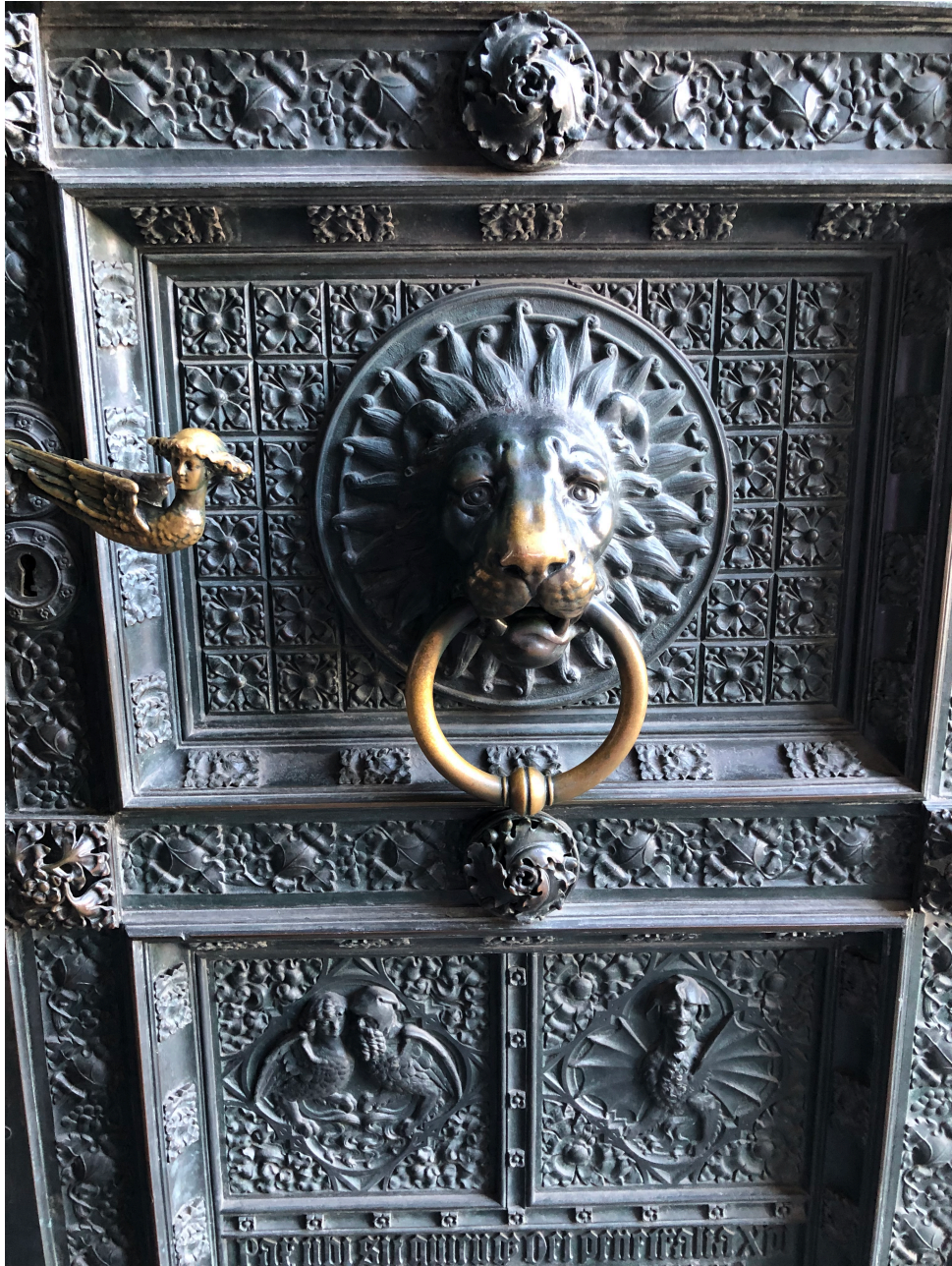
Intricate patterns on the entrance door.