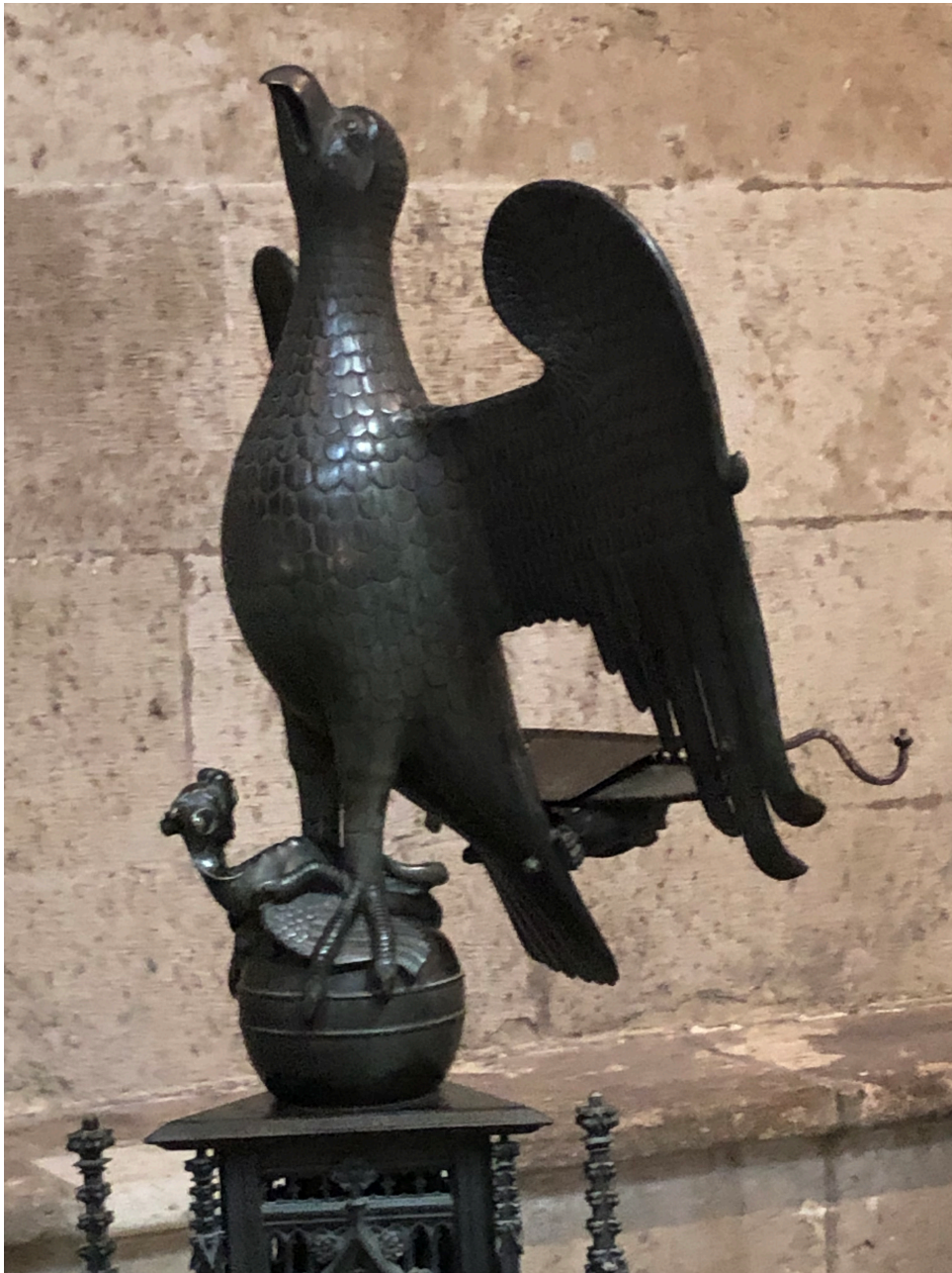
This is a lecturn ( the symbol of Cologne is the double eagle).