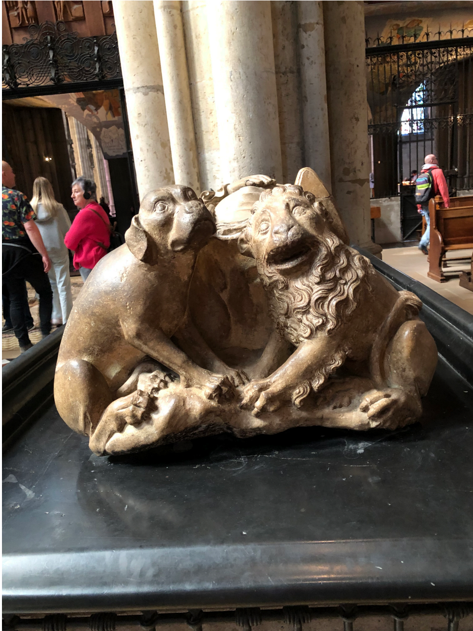
These two creatures are carved at the feet of the effigy.