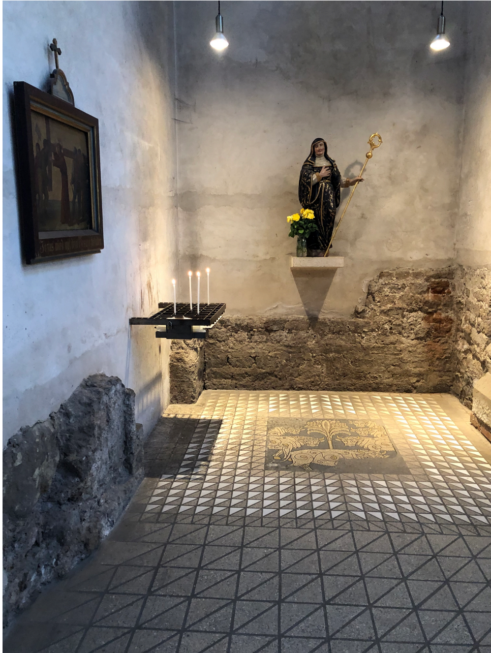
Religious statue in the Great St. Martin Church.