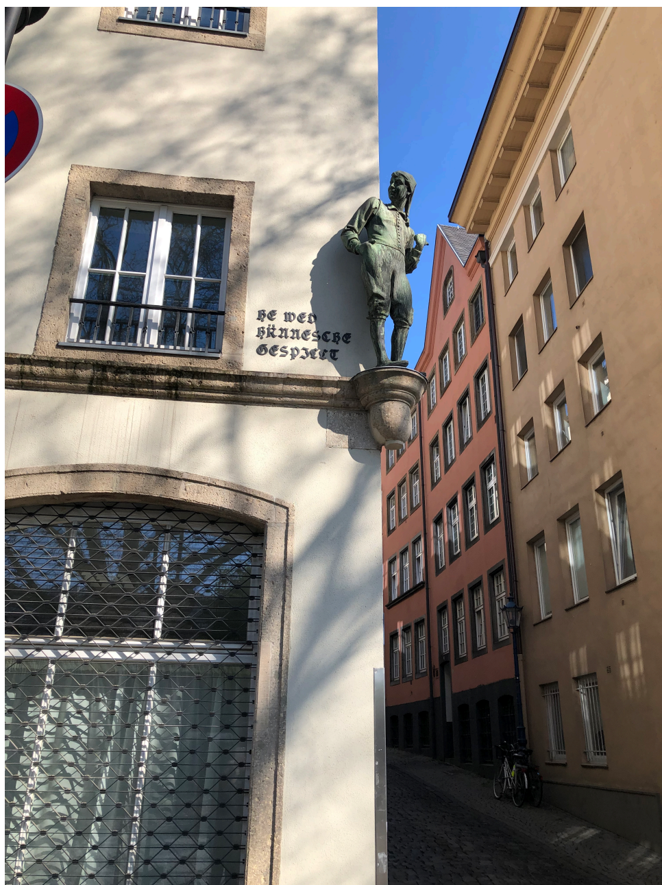
Statue on the corner of a building.