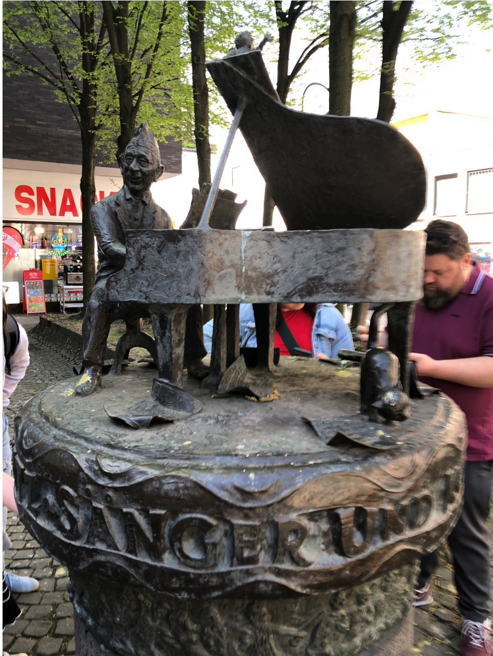
Pianist and cat statue.