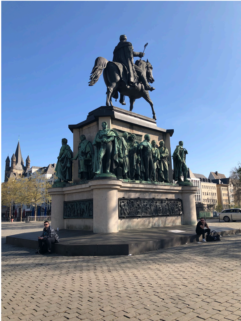
King Fredrick Wilhelm III