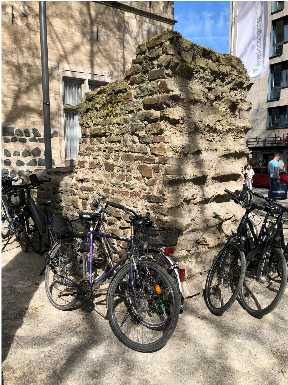
This is part of Archbishop Phillip I's city walls.