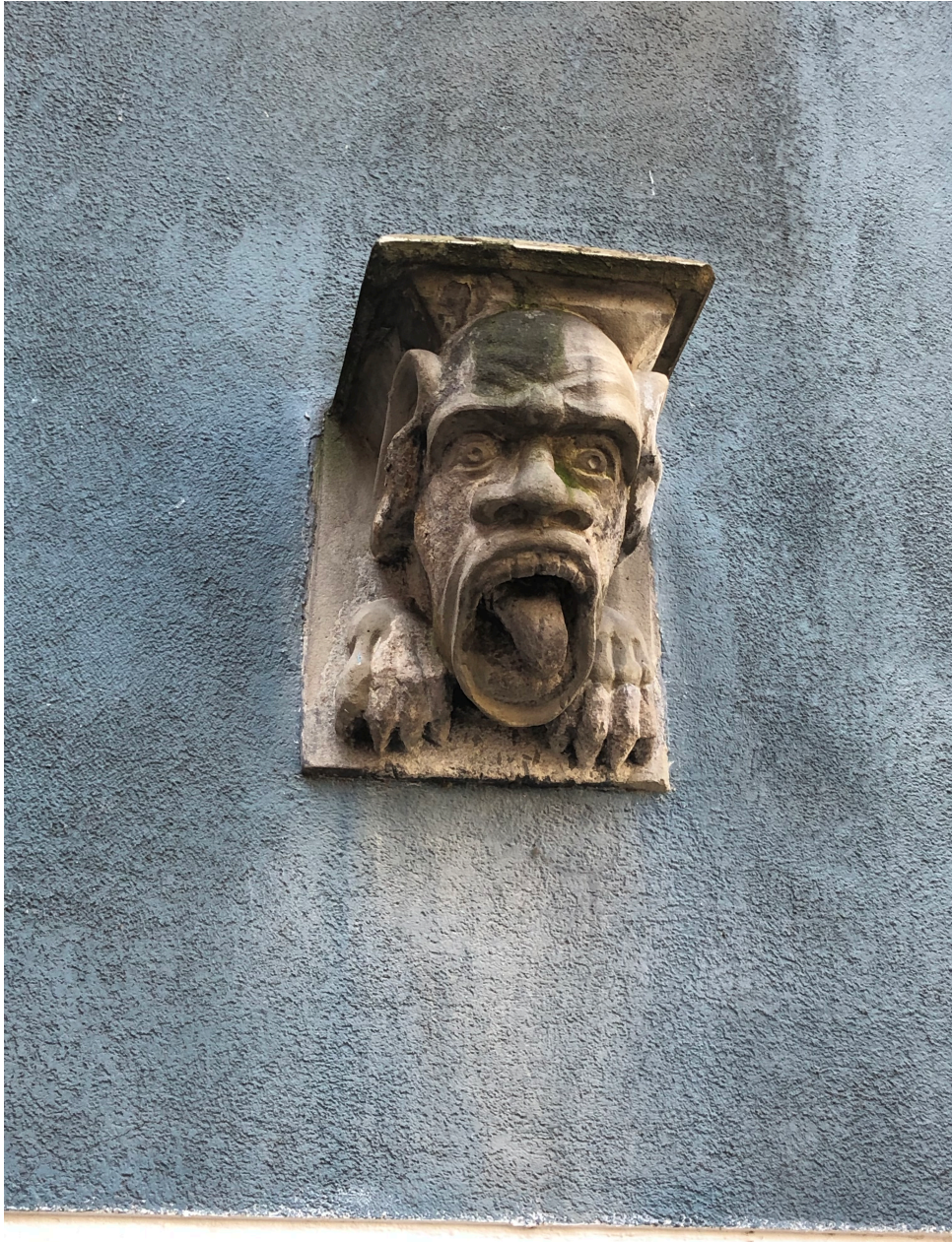
A wall plaque.