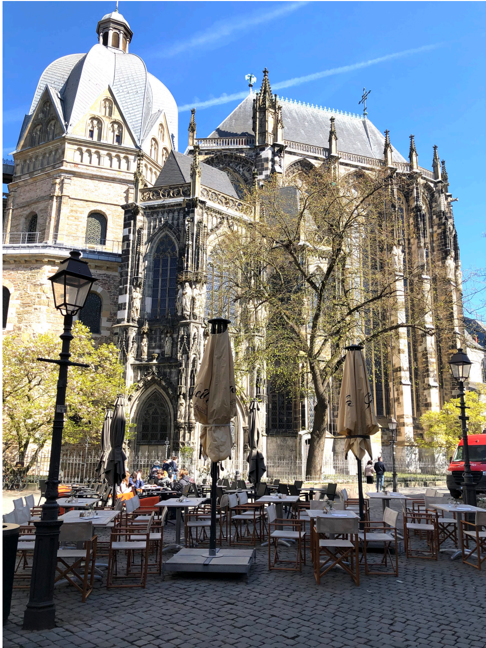
The Aachen Cathedral (from across the square... the local eateries are just setting up for the lunch trade).