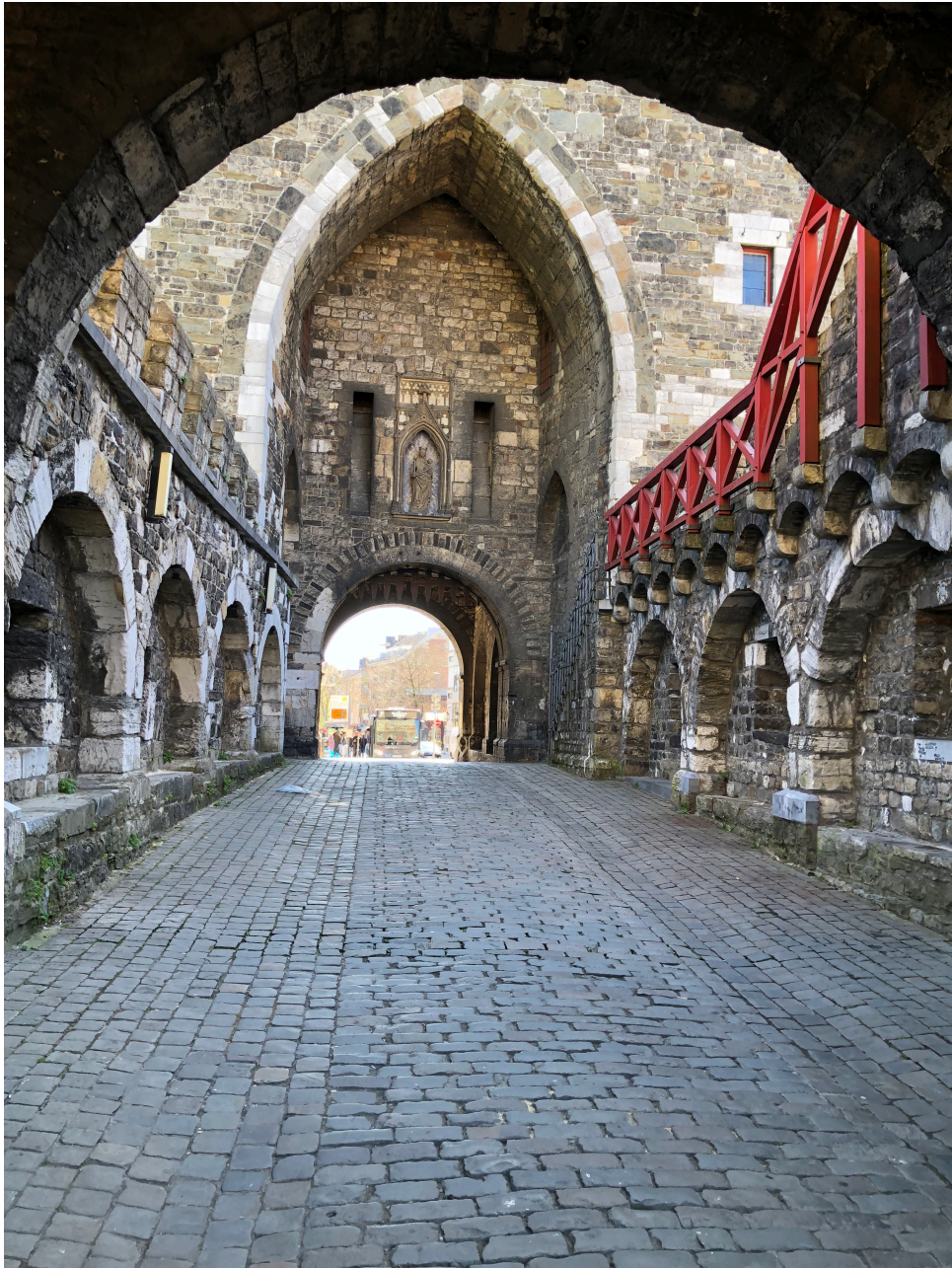
Looking through the Ponttor.