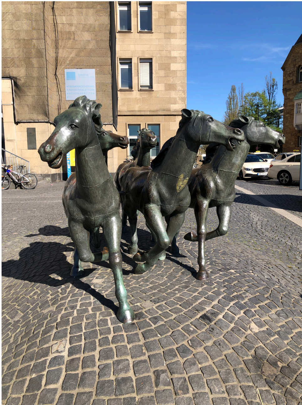
These horses are outside the Aachen train station.