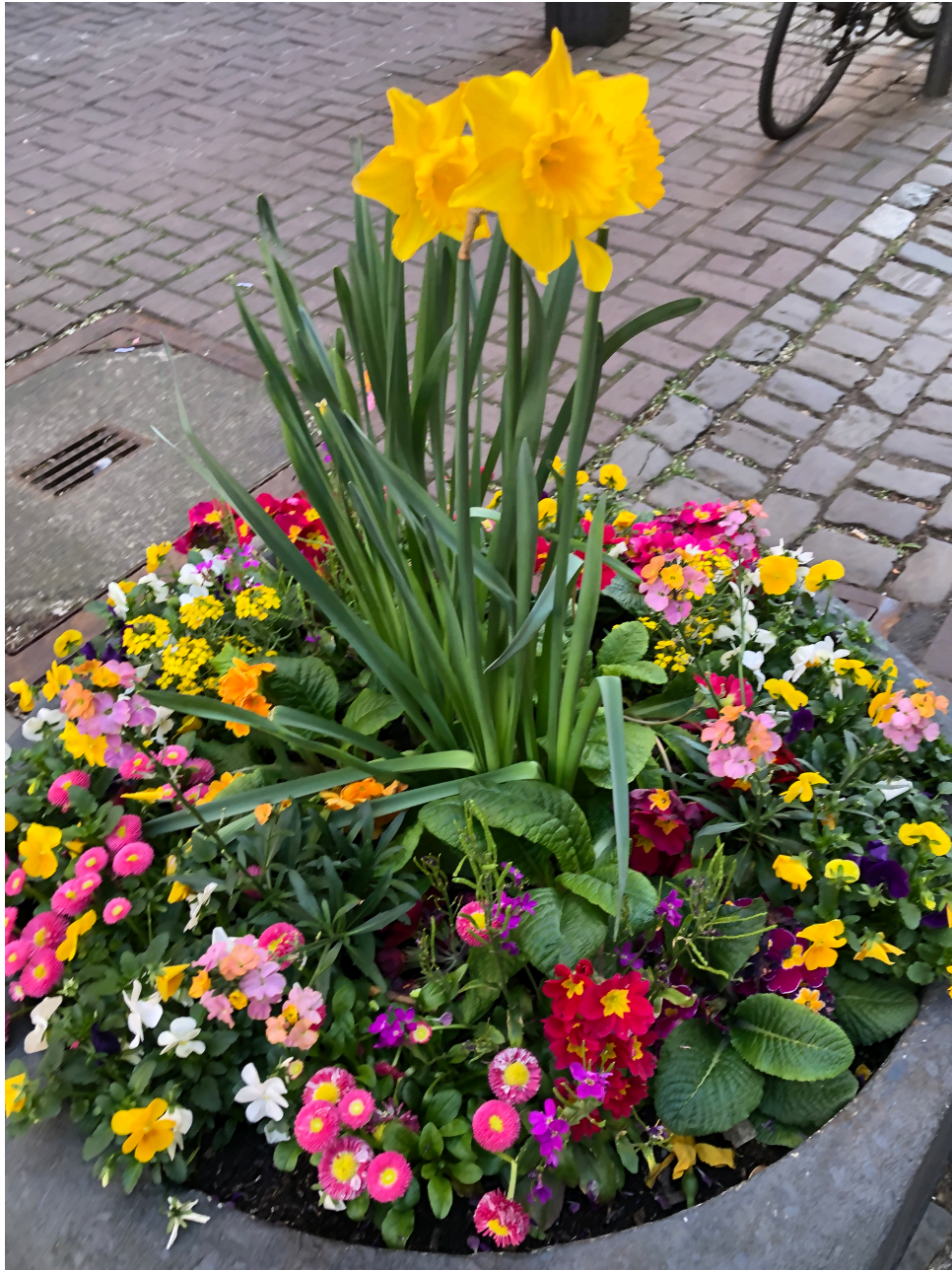
Flowers in tubs around the square.