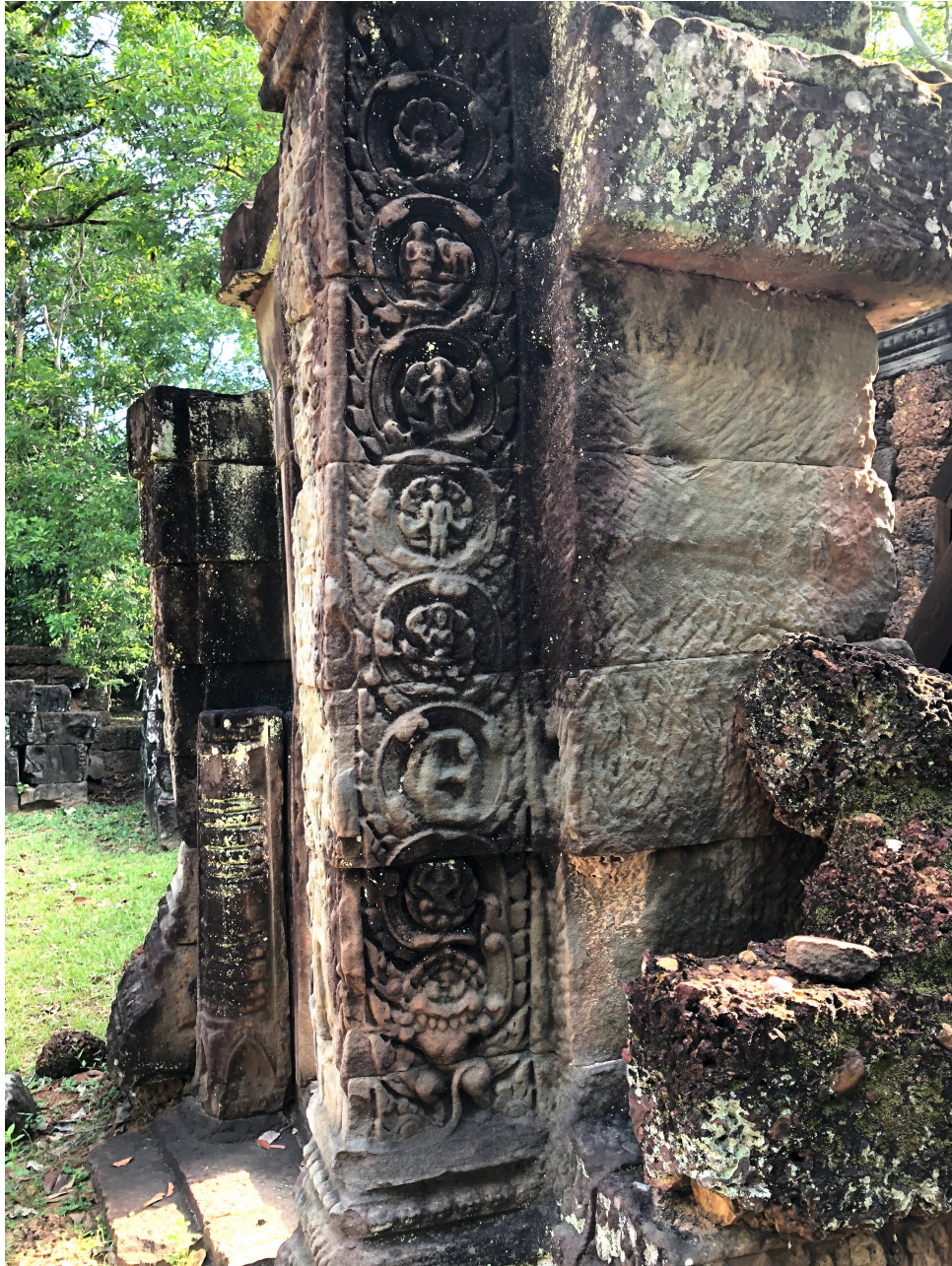
Carvings inside the eastern gopura. Note the lion at the bottom, holding up the other carvings (in medallions).