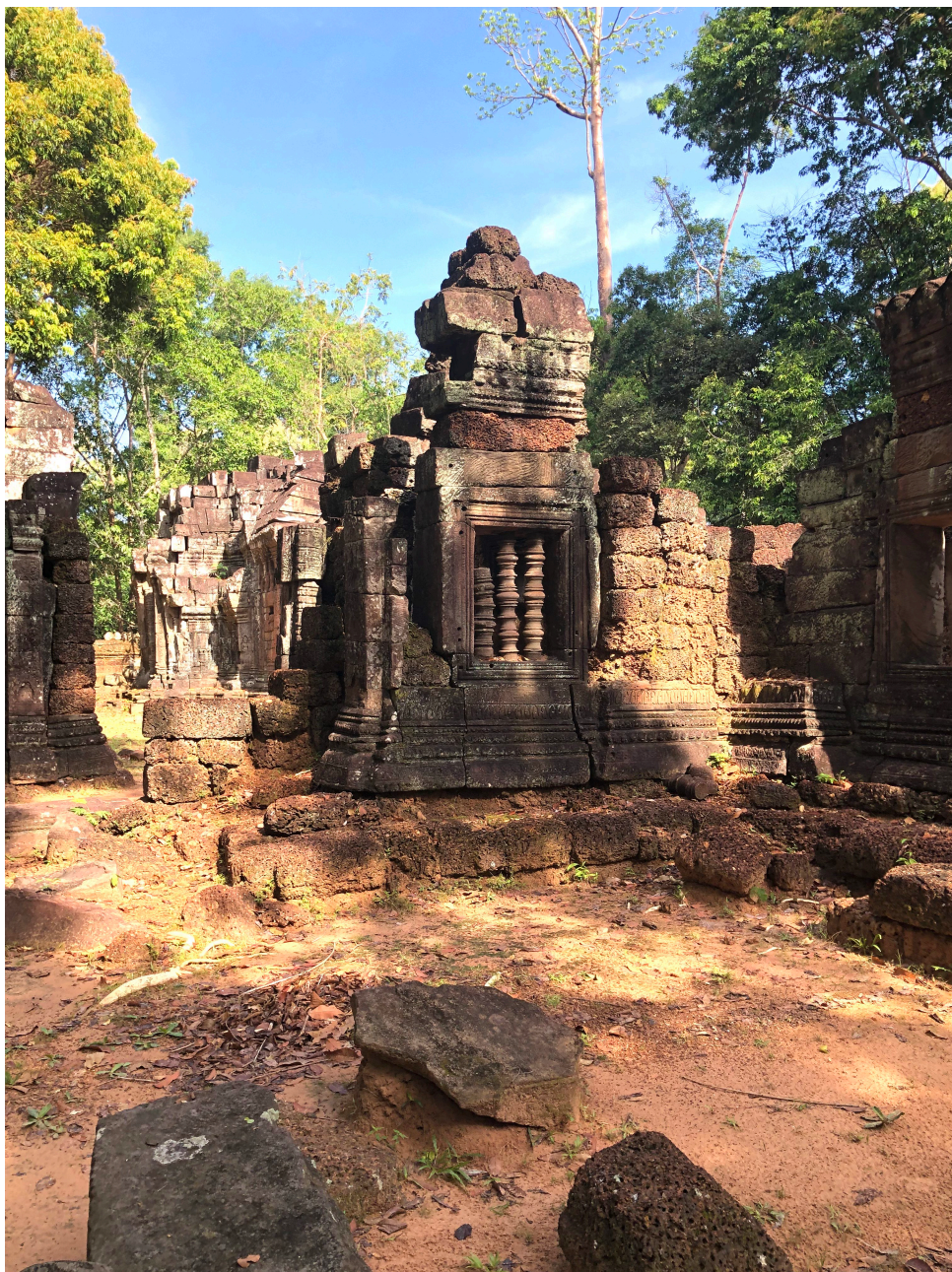
Krol Ko eastern gopura.

Krol Ko is a temple, with an outer wall, a moat and water reservoir, inner wall with gopura and a central tower. We like the carvings here.