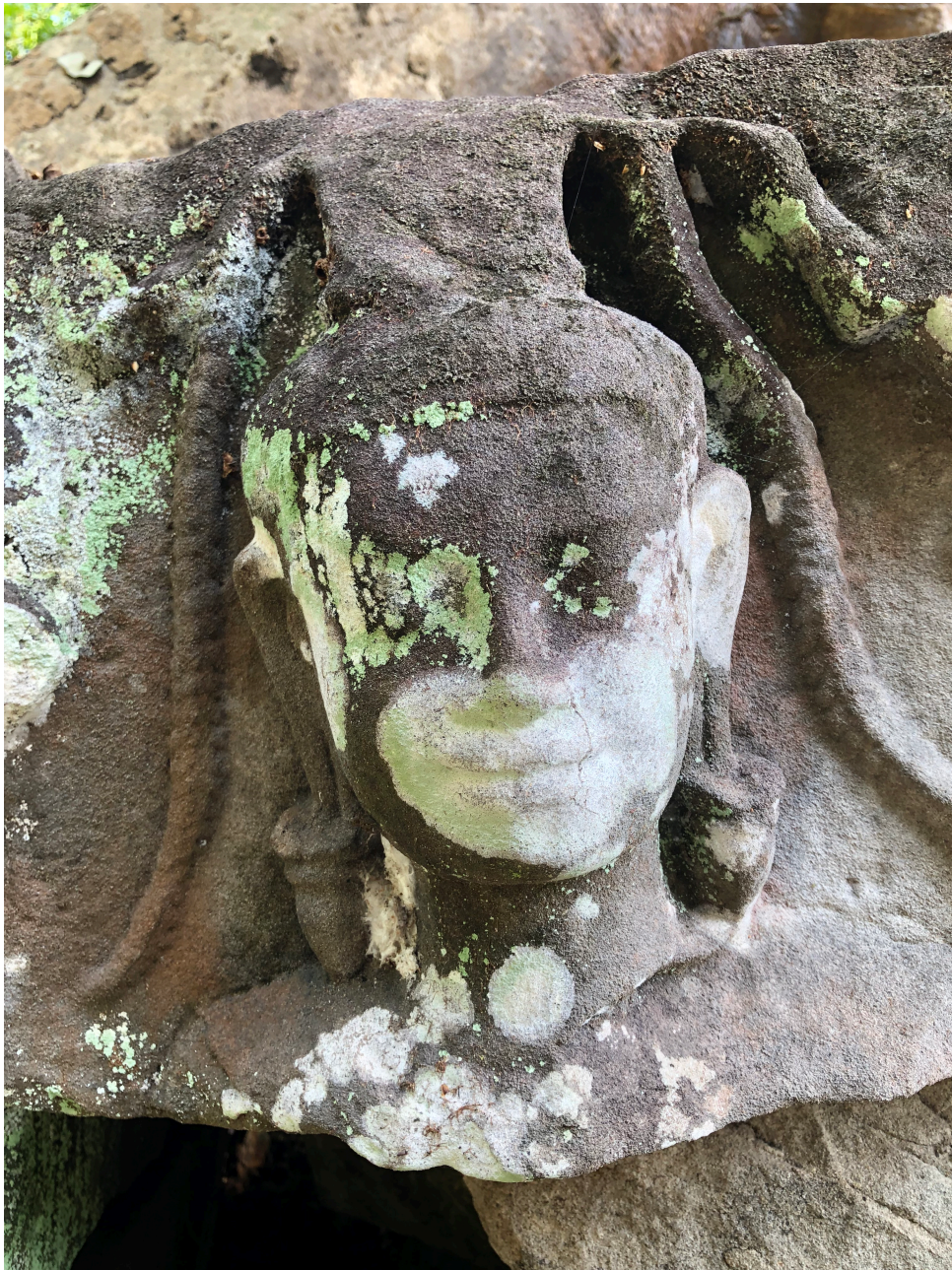
A devapala, softened with time.