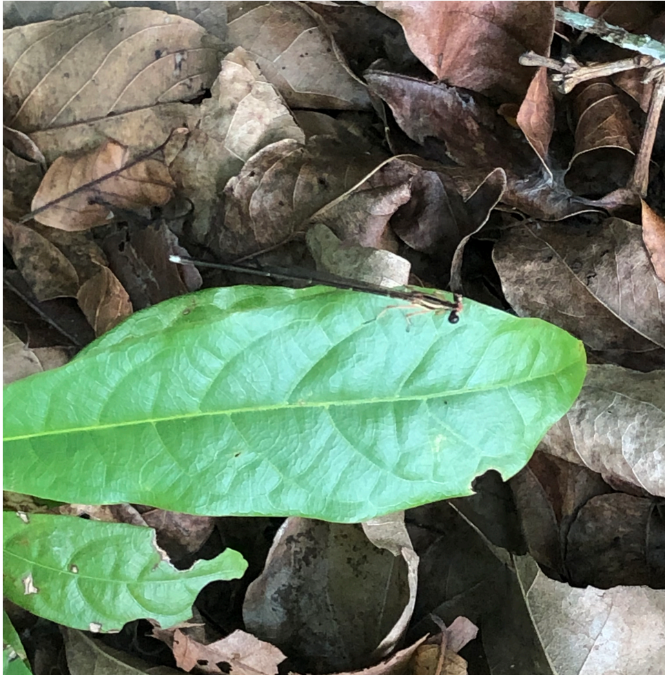
A very different dragonfly, about 4cm long, but so thin.