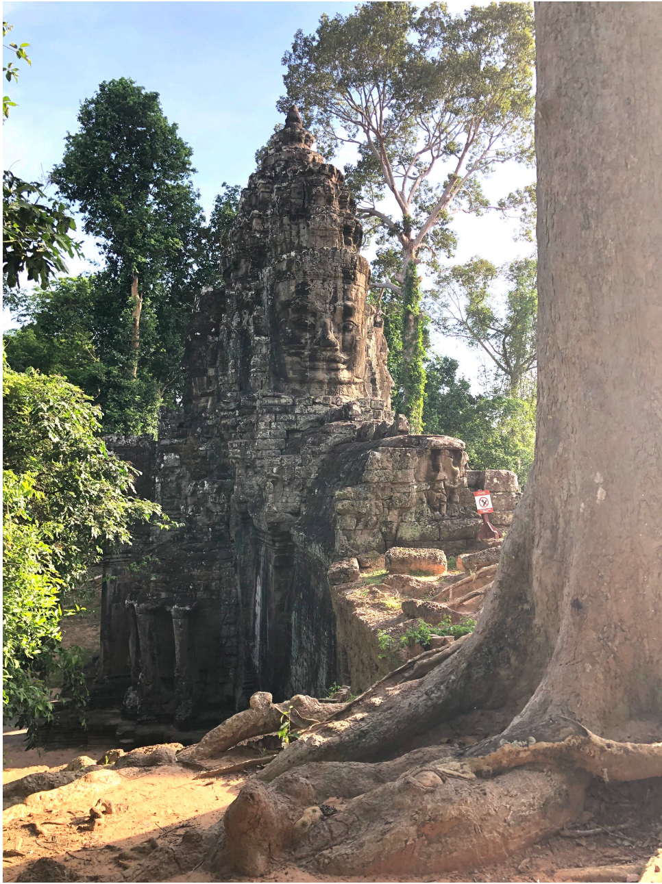
Victory Gate and trees in the morning sunshine.