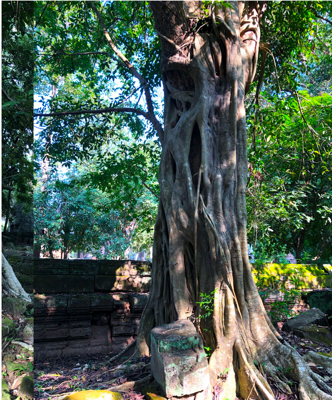
Strangler fig inside the compound.