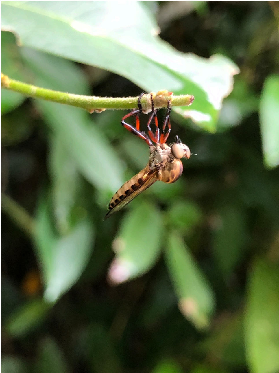
A robber fly (or assassin fly) - related to dragonflies.