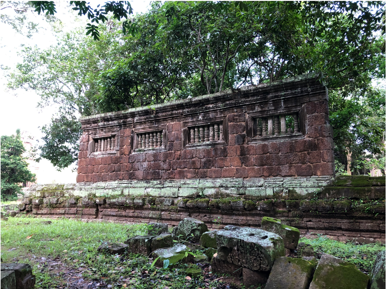
The North Kleang, built in a different style to the temples.