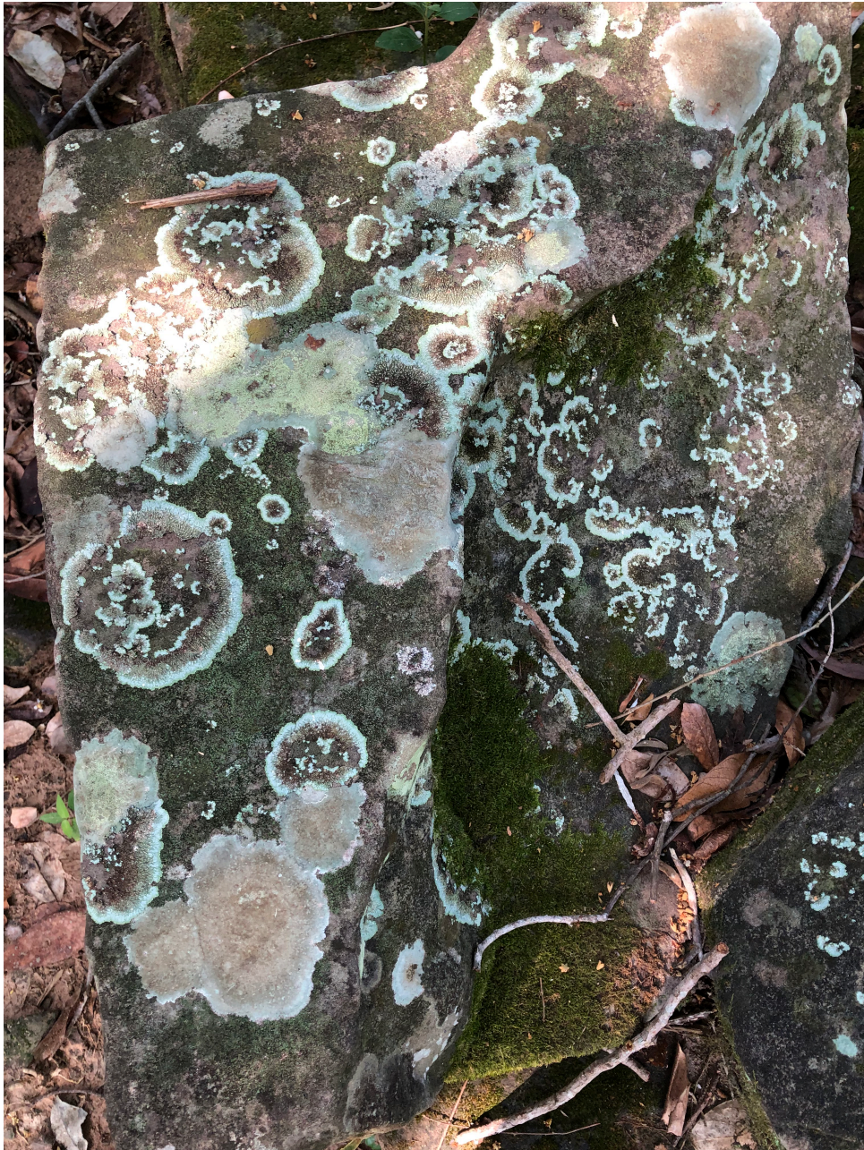
Lichen making patterns on the sandstone.