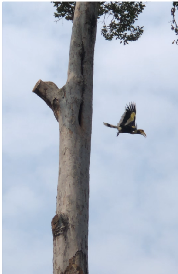
Photo from the video of this one flying from its nesting tree (across the road to another tree).

A quick stop on the way back past the Bayon gave us the opportunity to see the hornbills.