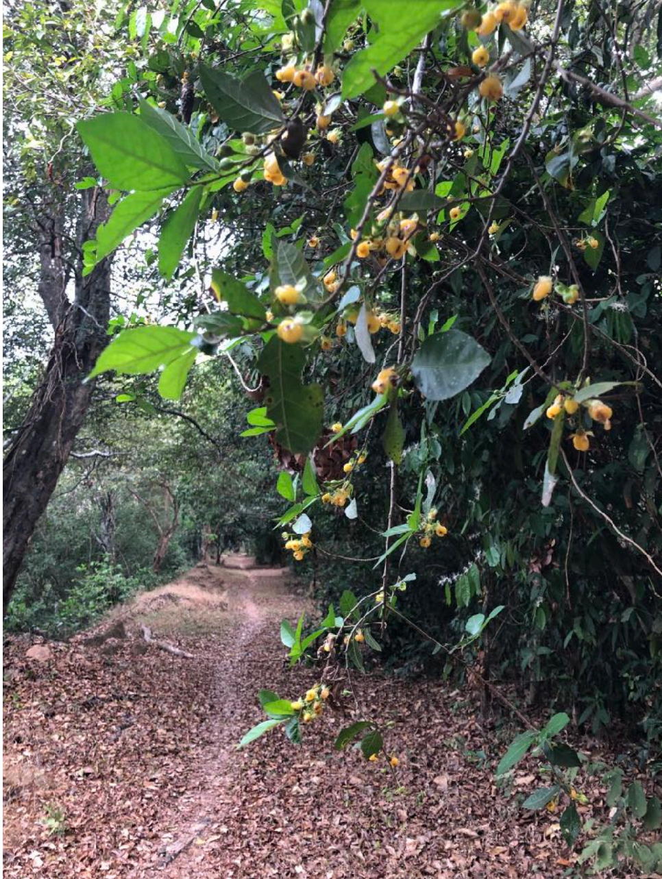
More yellow berries and the path along the top of the wall.