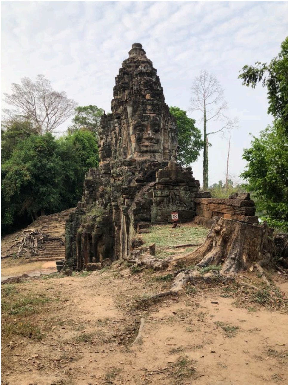
The West Gate from the north.