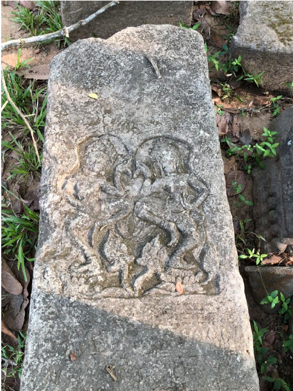
Carvings of Apsaras.