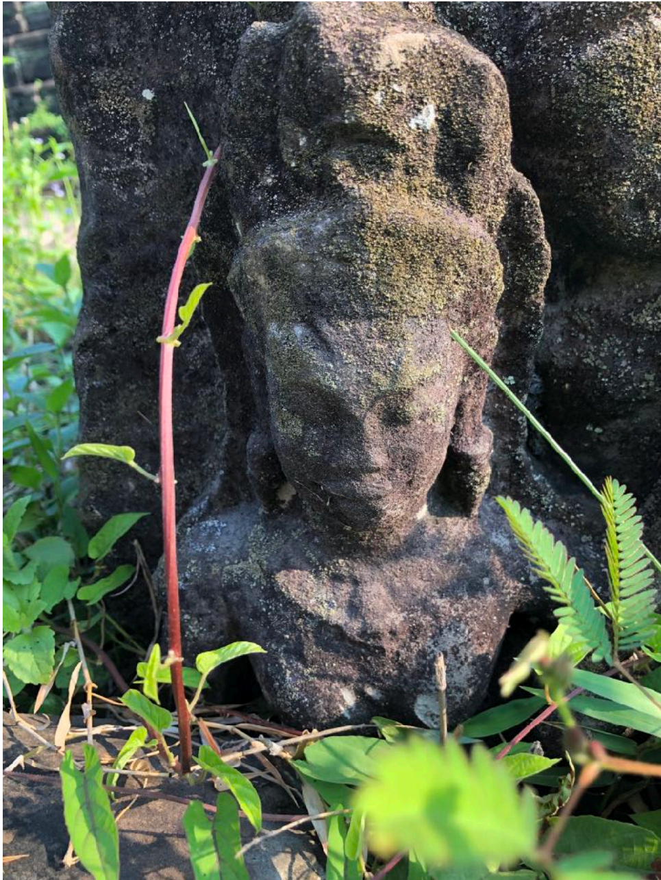
Weeds growing around these blocks lying in rows around the Bayon.