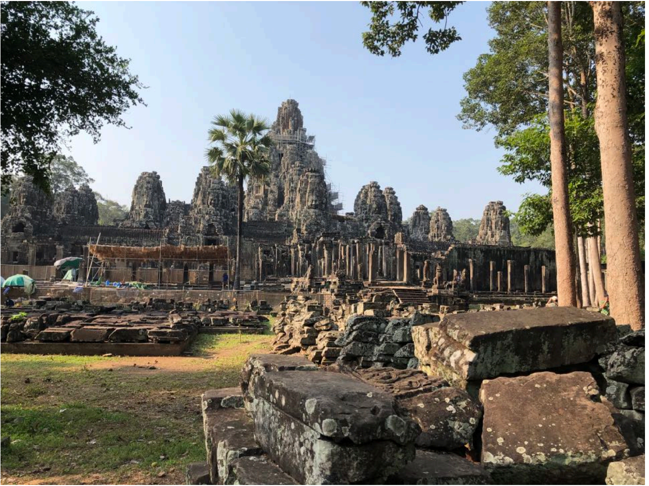
View of the Bayon and the surrounding blocks.