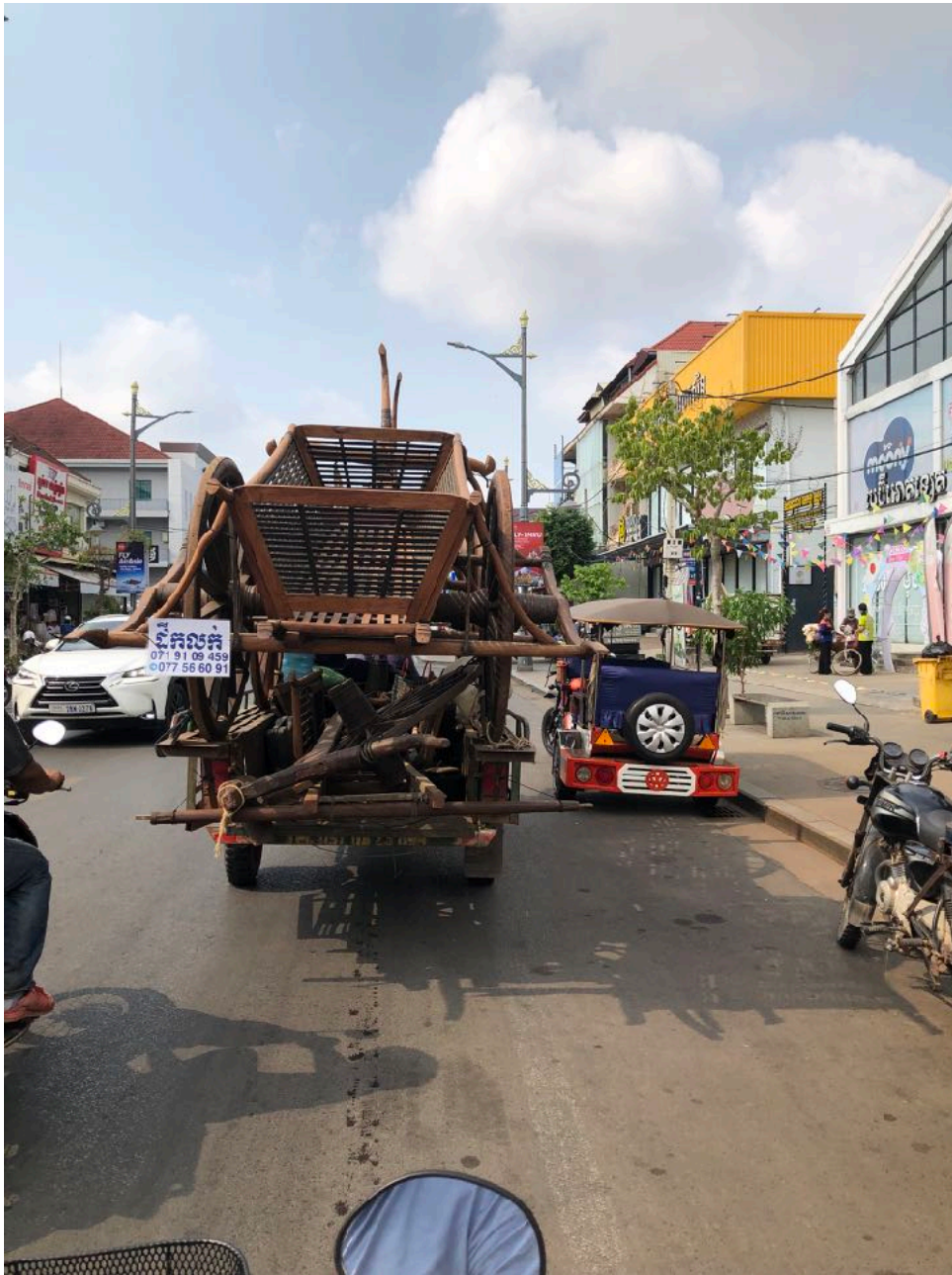
On the way home, we saw this trailer carrying the buffalo carts.