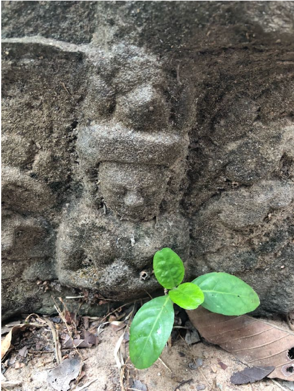
A humble carving.