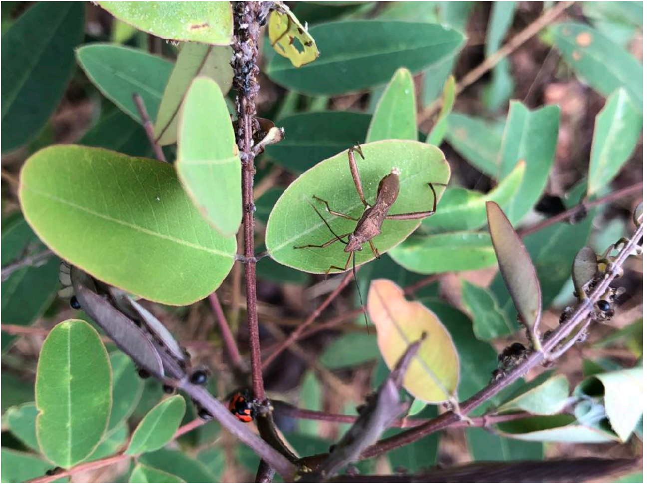
A different view of these insects.