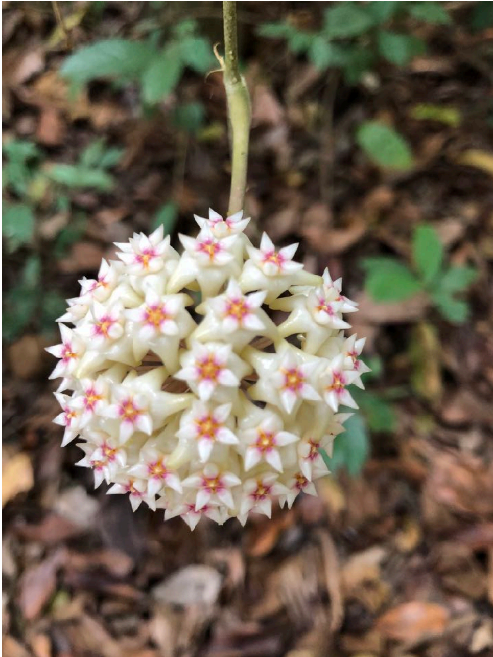
Hoya flower (growing wild, hanging from its vine growing in the tree branches).