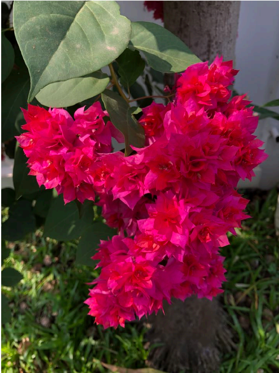
The bougainvillea at our place.

I am getting used to my language lesson on Wednesdays. It is a clear signal of the middle of the week.