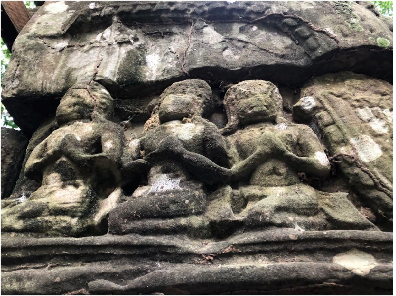
Worn carvings at Prasat Chrung NE.