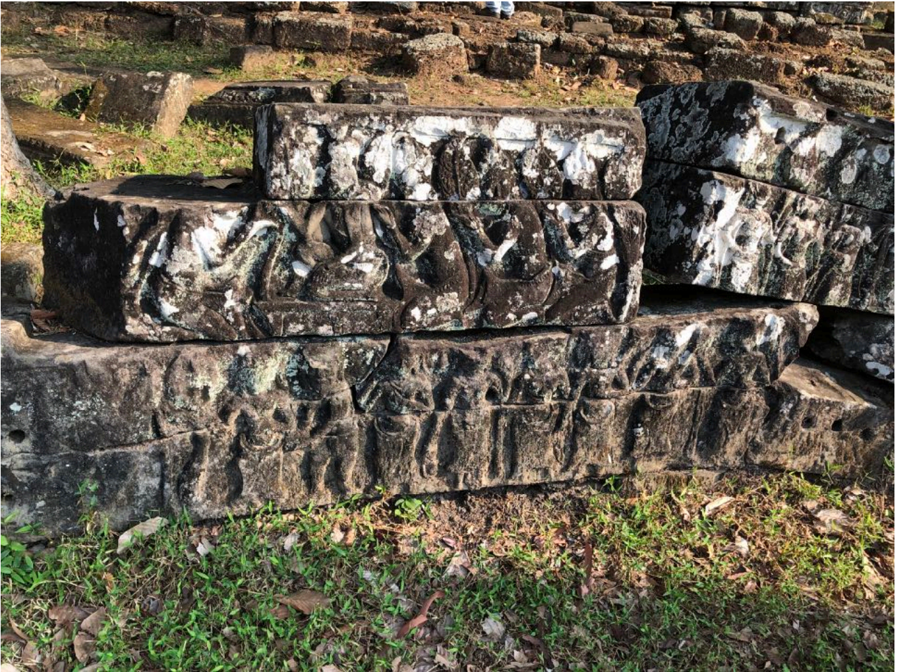
More carvings of people in prayer.