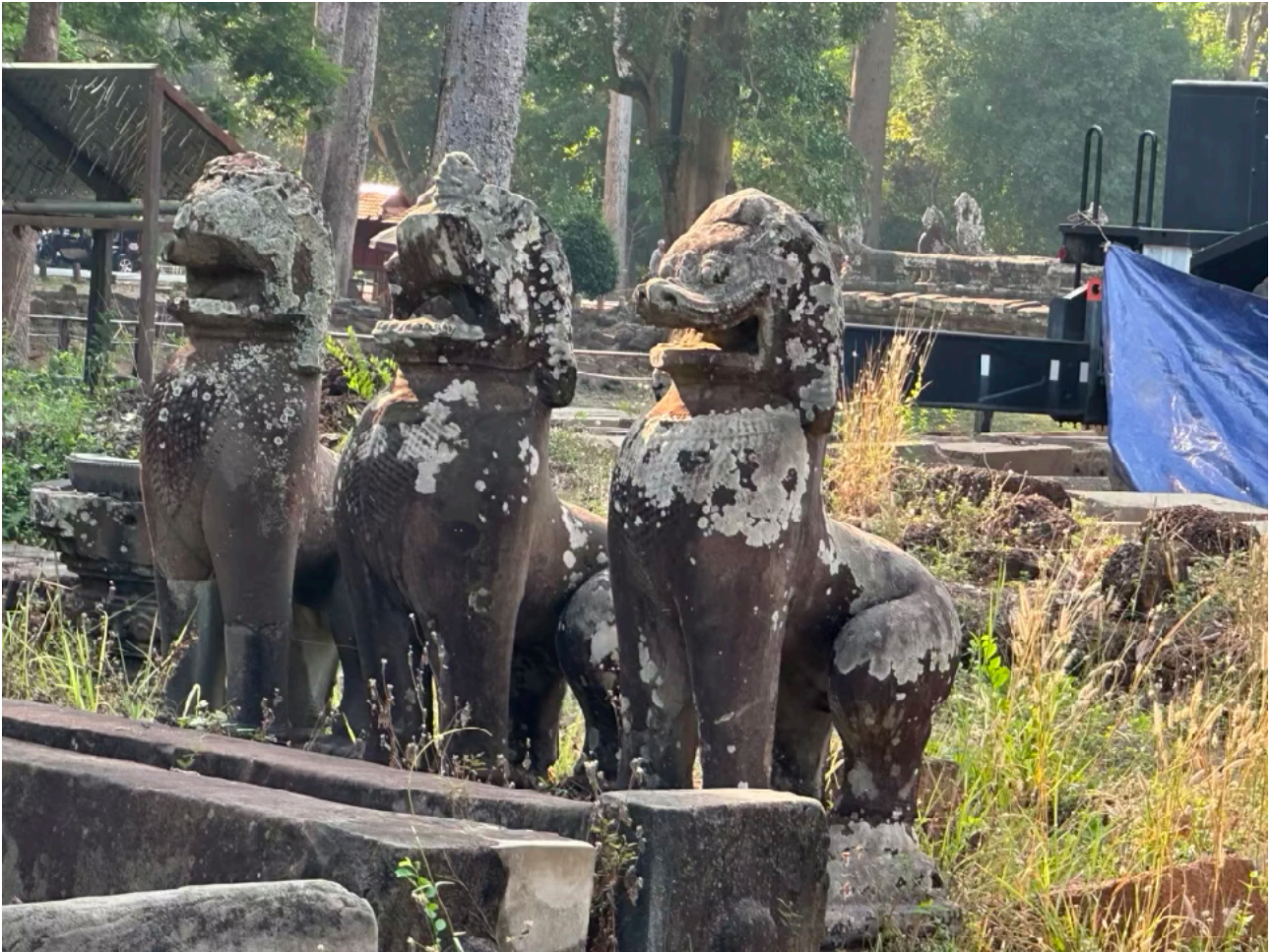
Guardian lions waiting to be replaced on the steps to the entrances to the Bayon.