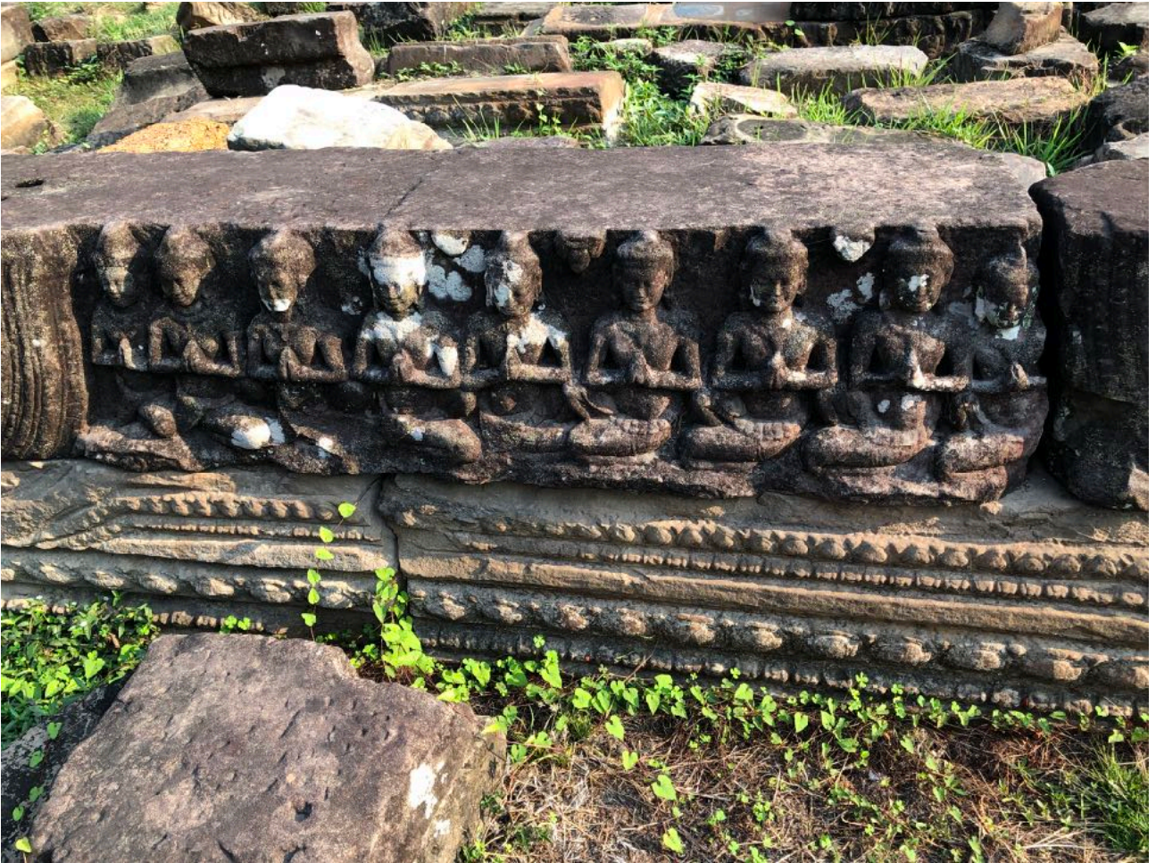
Line of people praying.