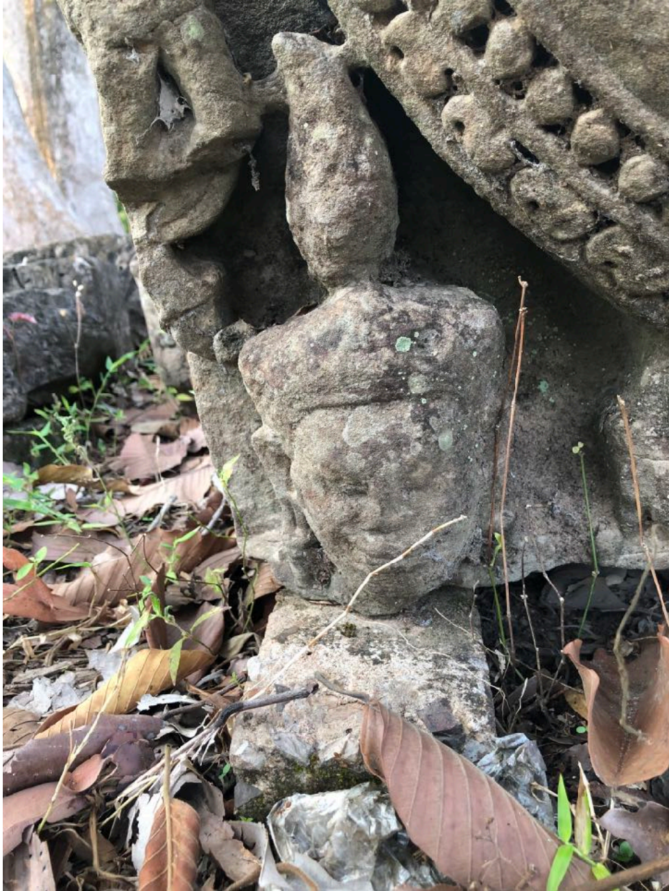
Statue with an interesting headdress (or hair-do?).