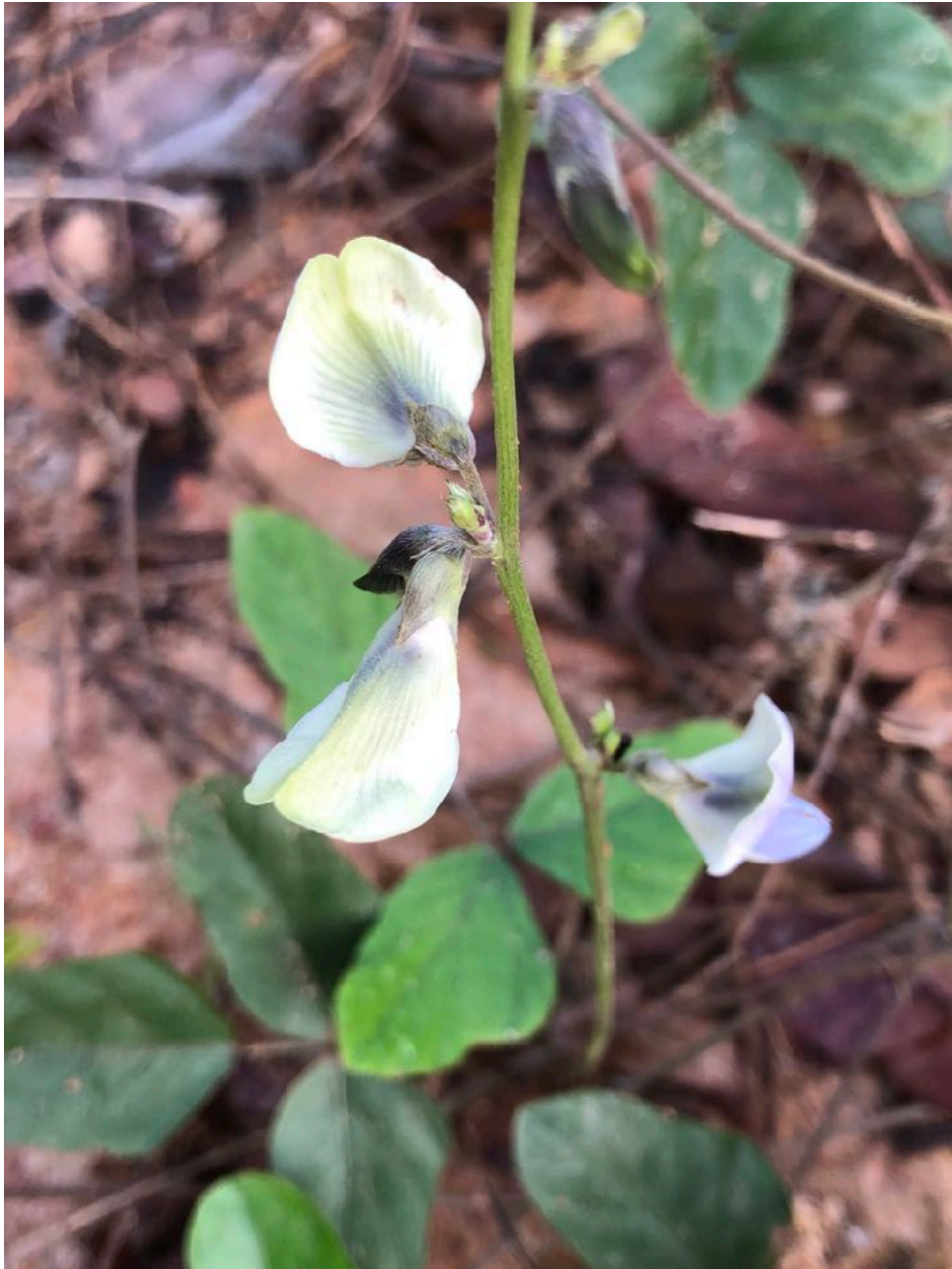
Interesting pea flower.