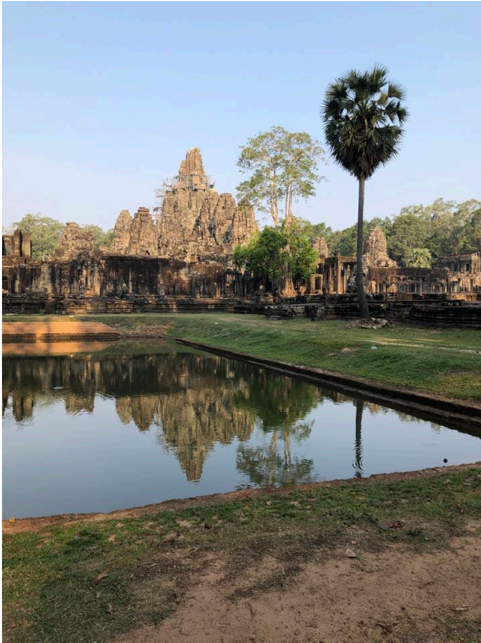
The Bayon and reflection.