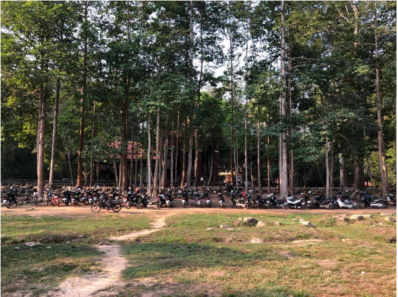
Worker's parking lot.