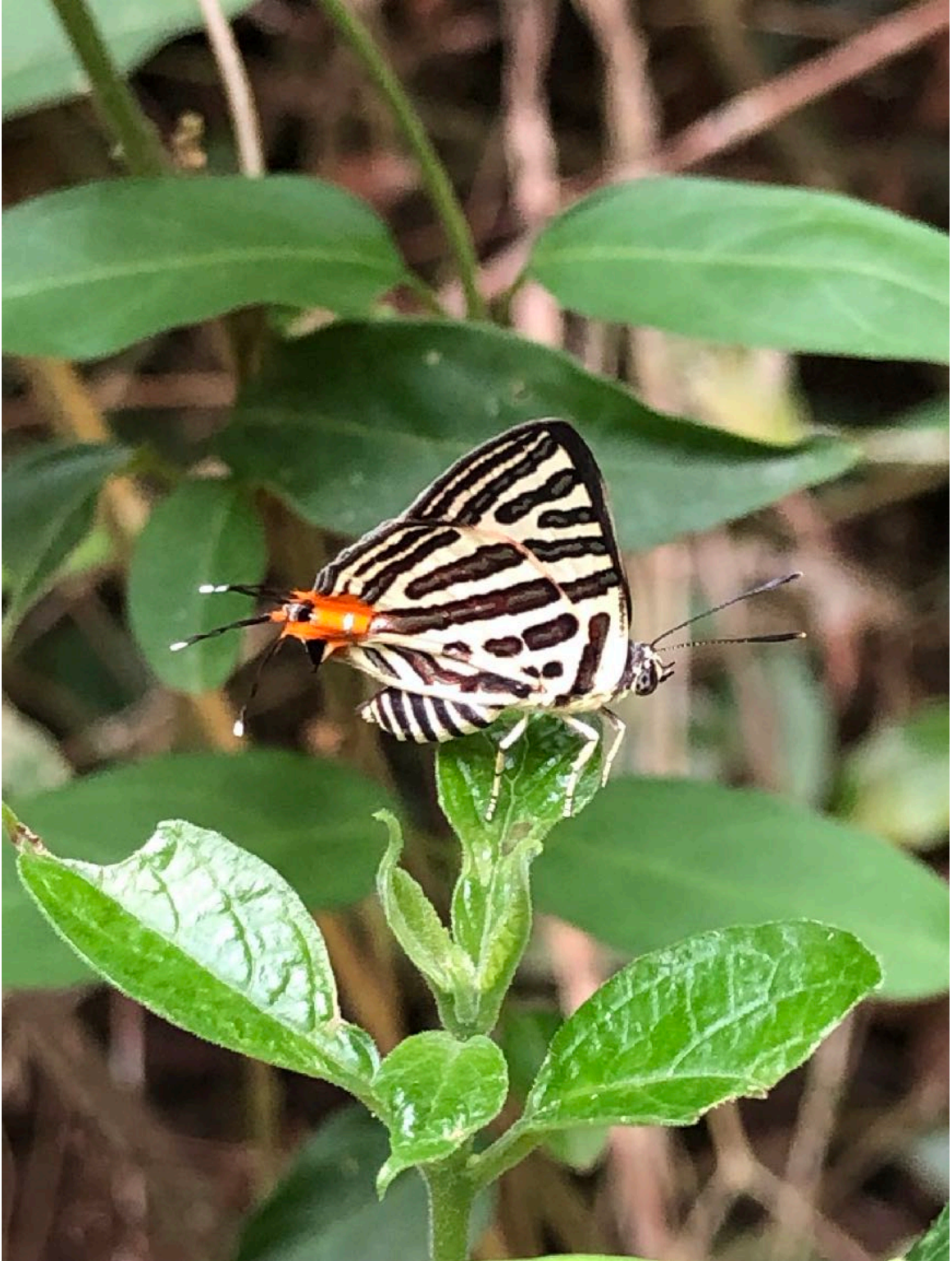
One of the Imperial butterflies.