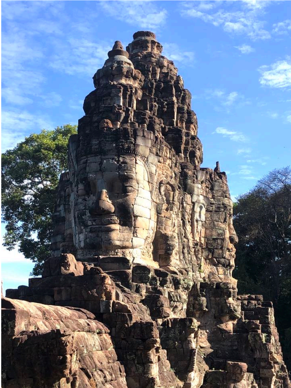
The West Gate.