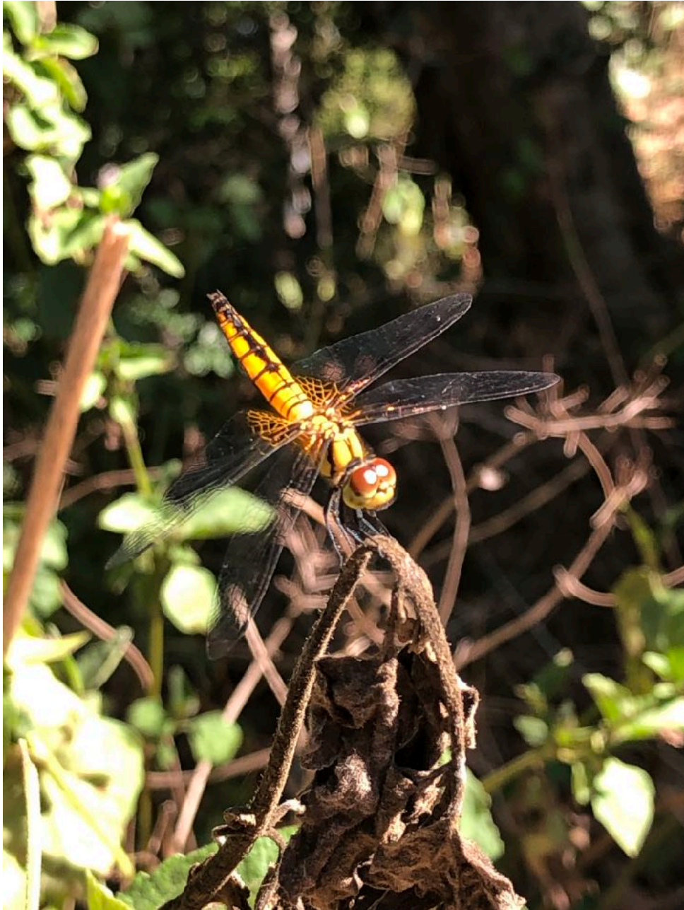
A dragonfly in the sun.