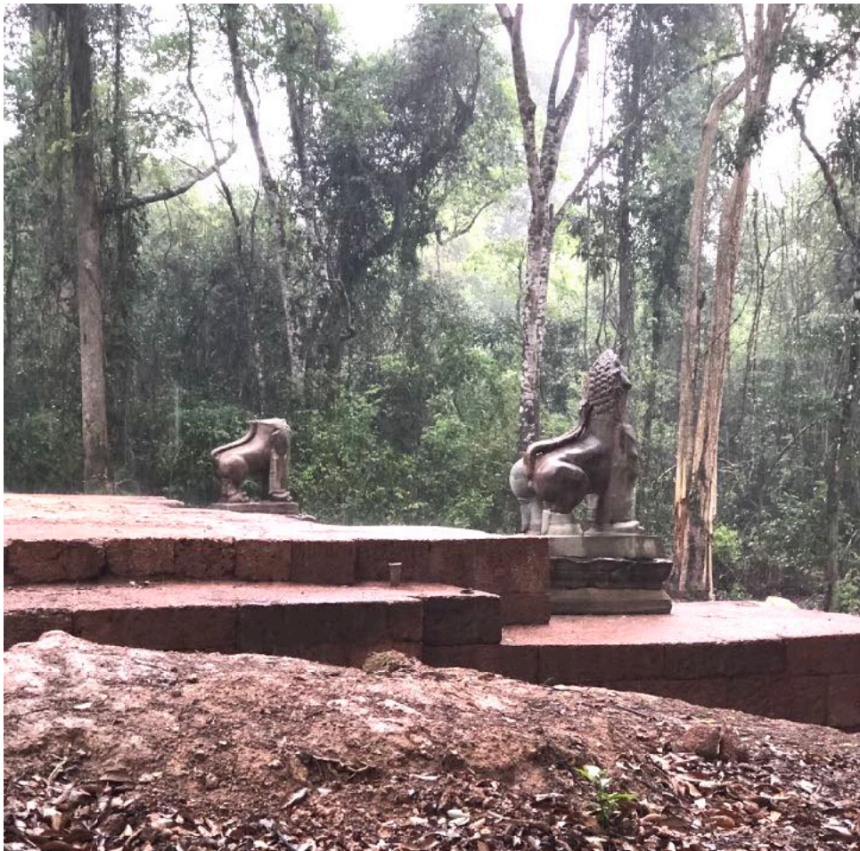
The two lions on their pedestals.

We braved the rain, just a few spots at first, and then heavy rain.