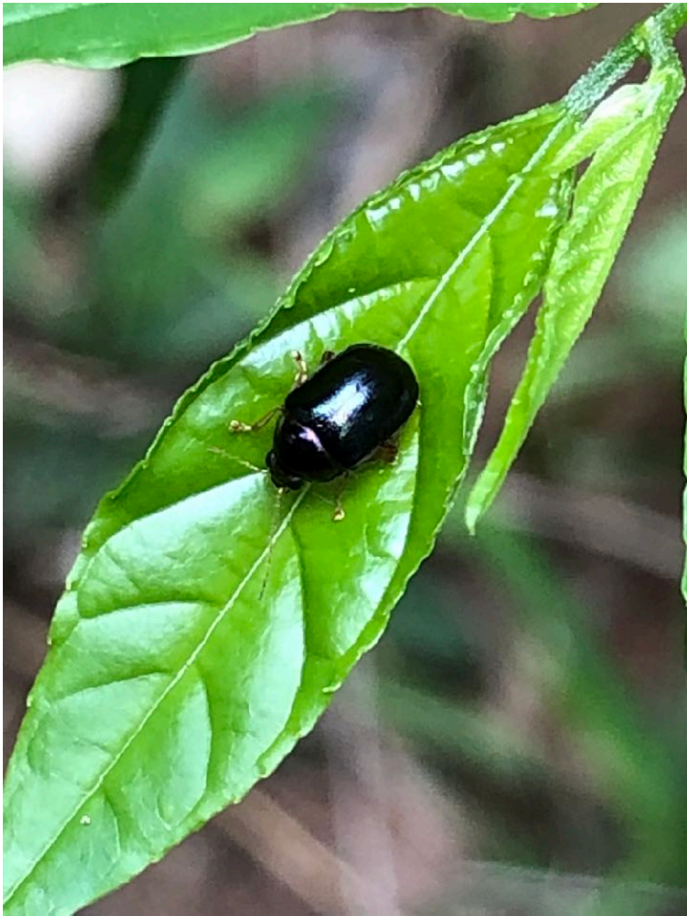
Very shiny, blue-black beetle.