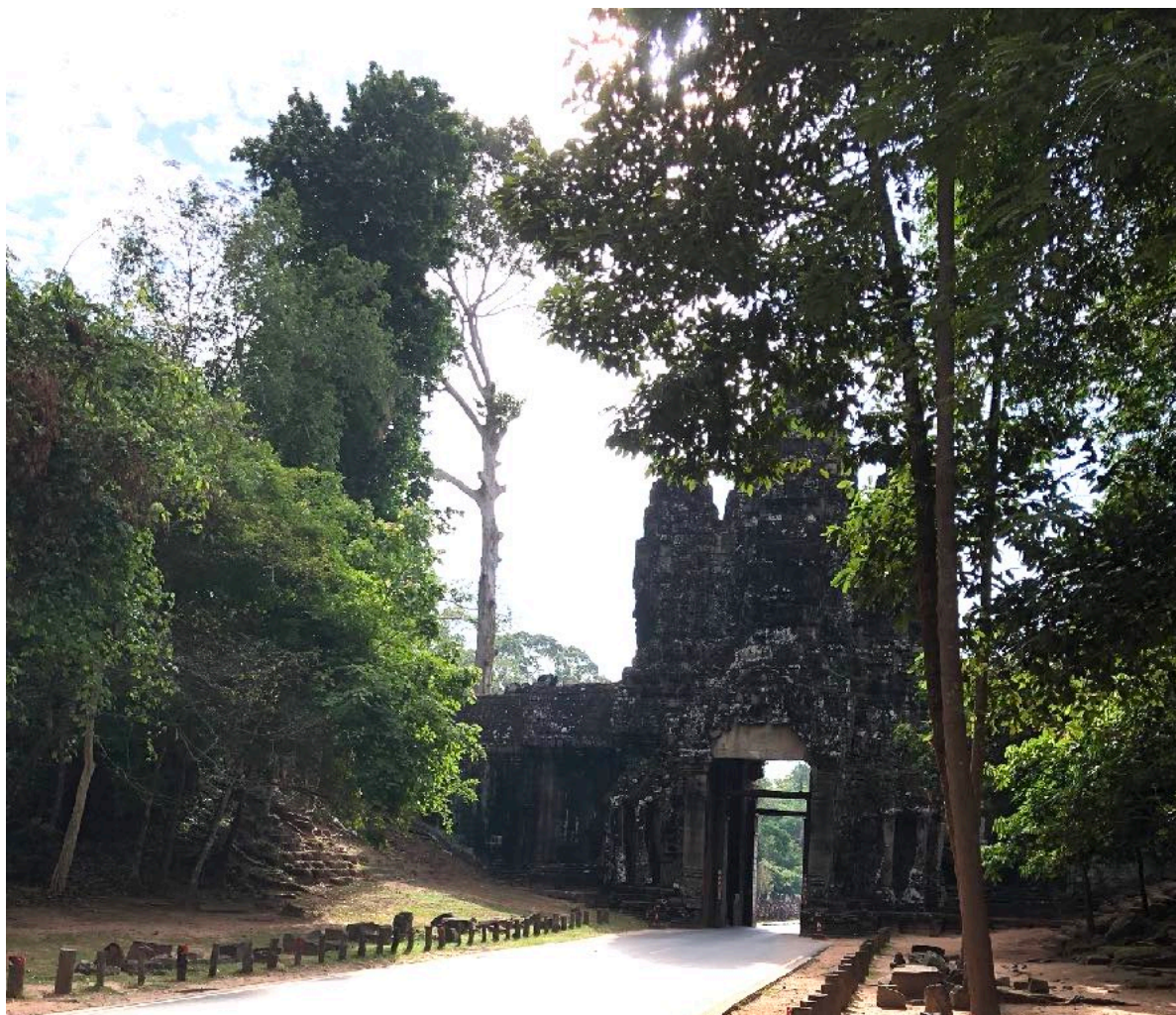
The Victory Gate from the road.

A shortish walk today, as I am still feeling a bit under the weather.