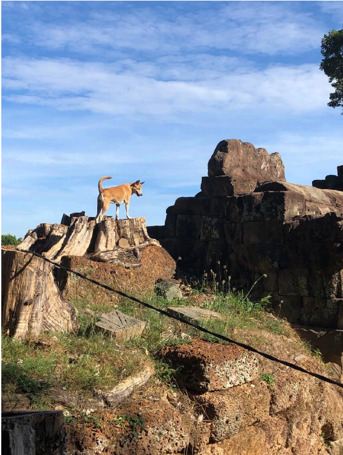
The dogs show off.