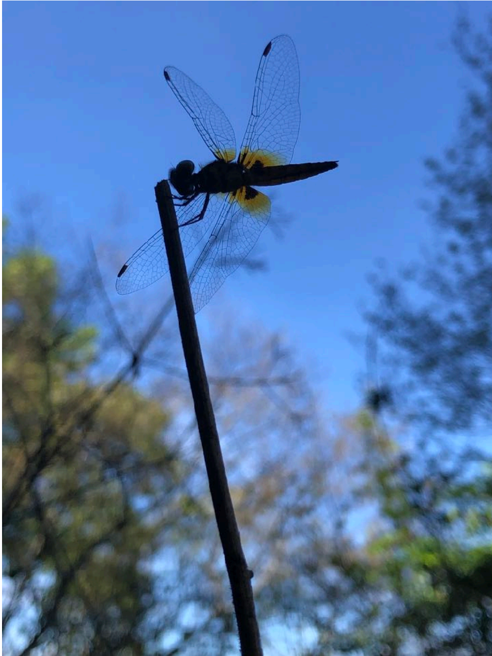
Dragonfly, against the sky.