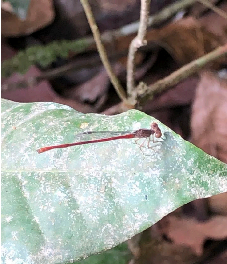
Tiny, thin dragonfly (damselfly?)