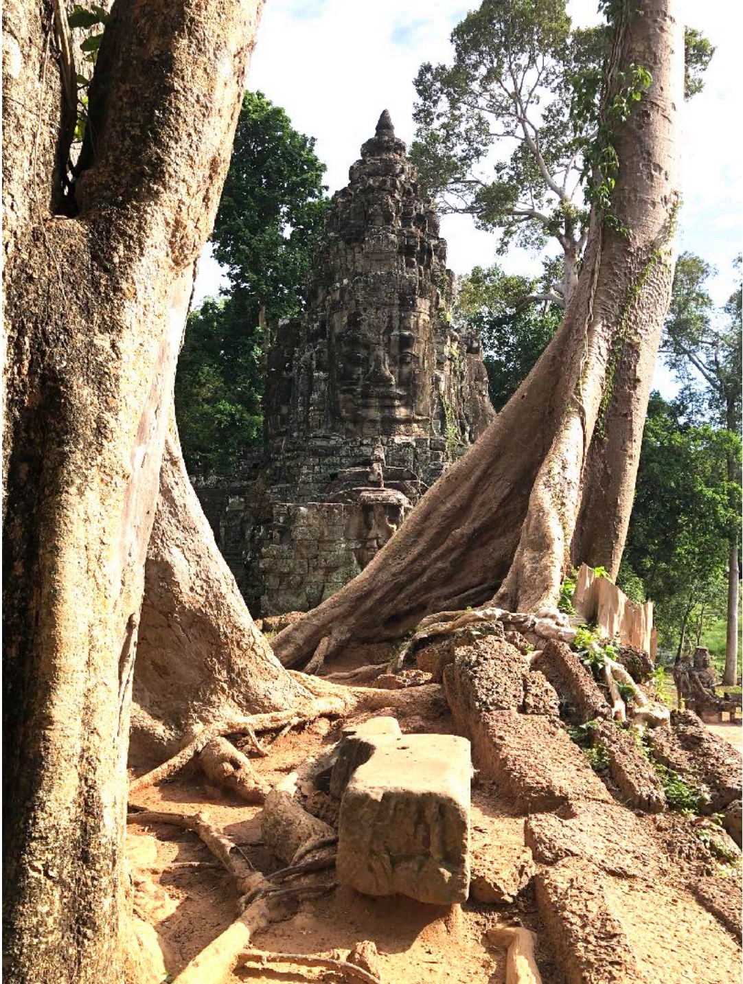
Classic view of the Victory Gate from the wall.