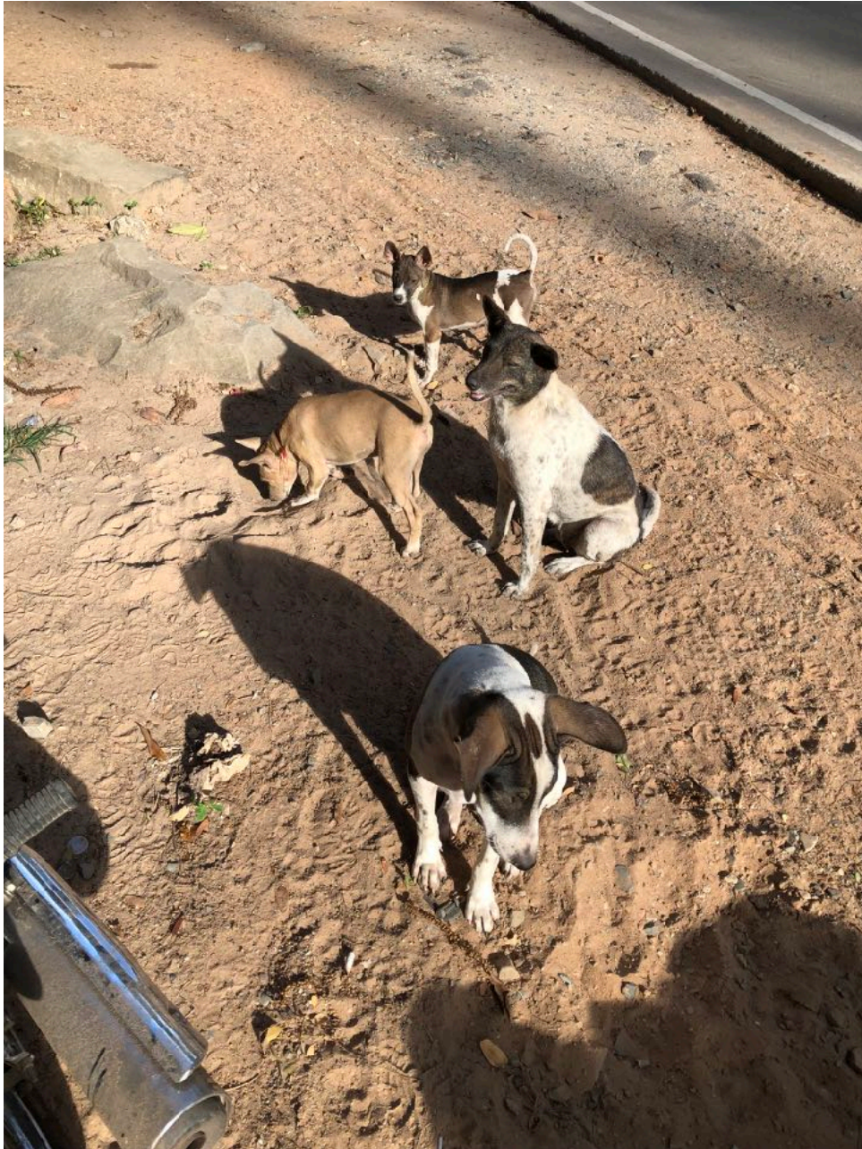
The dogs at the West Gate.

Wall Walk : West Gate to SW Prasat Chrung