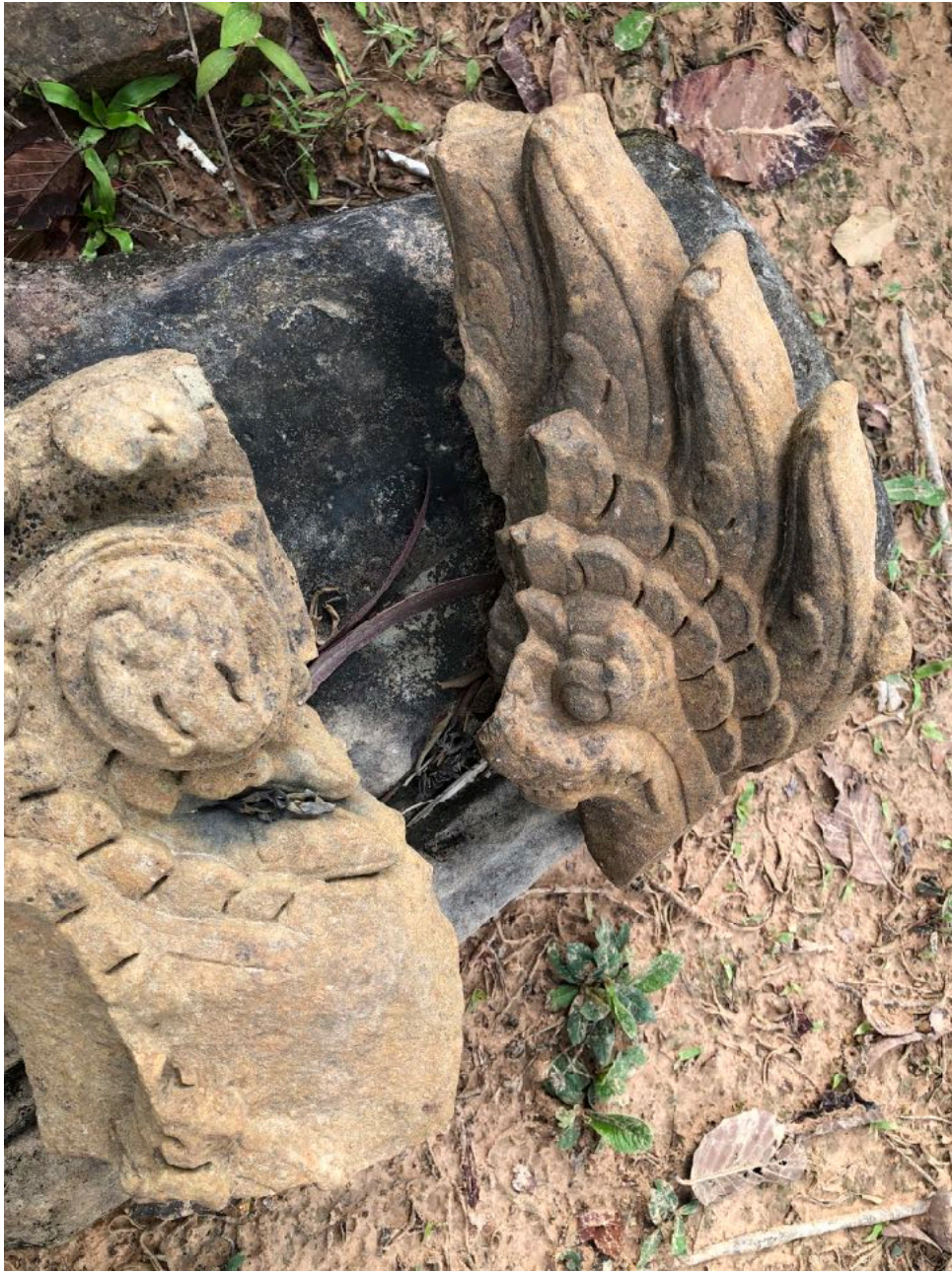
Original carvings, rescued and placed neatly in the temple grounds.