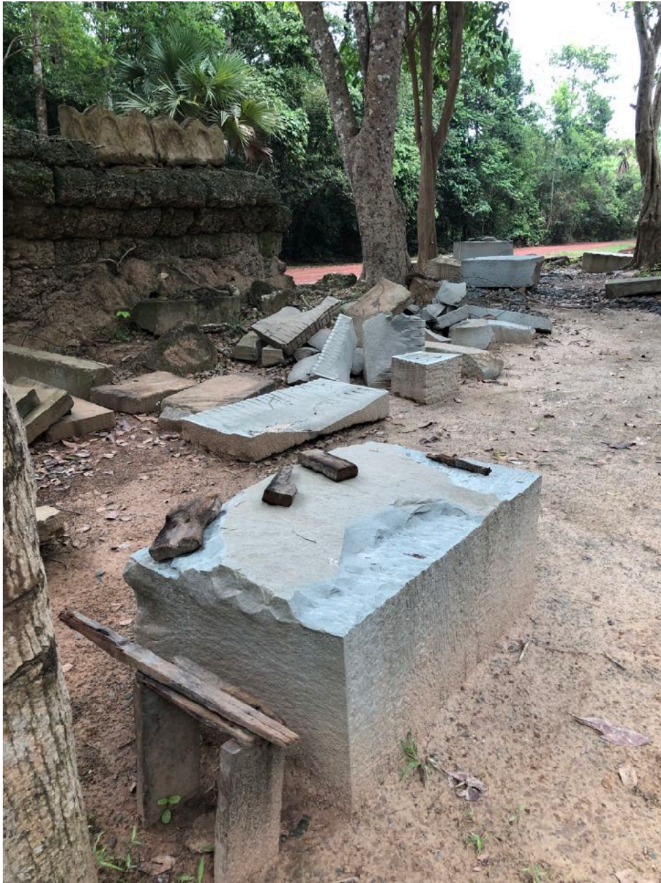
Spare blocks of sandstone for the restoration.