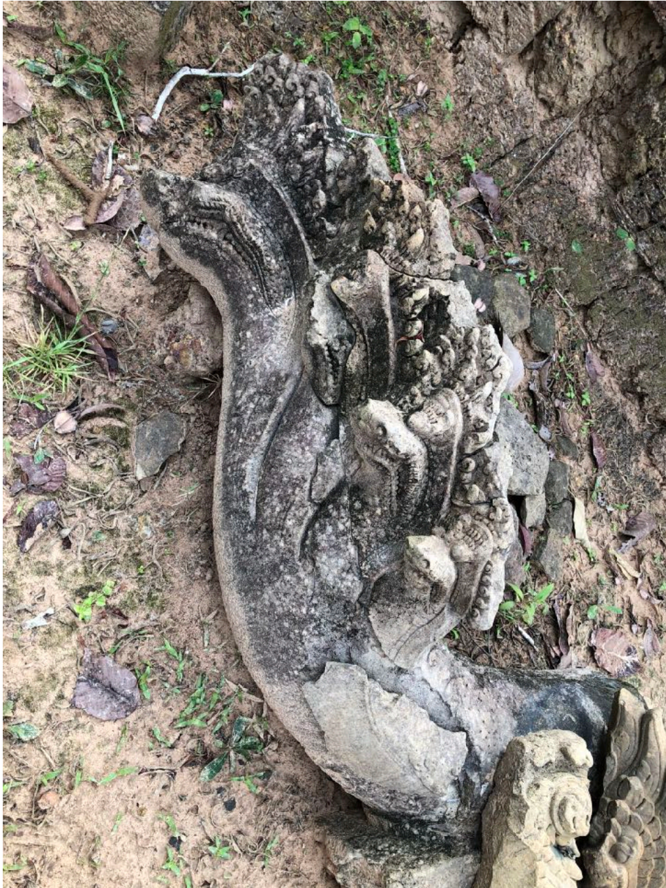
Seven headed naga ... part of the balustrade up to the East Gopura.