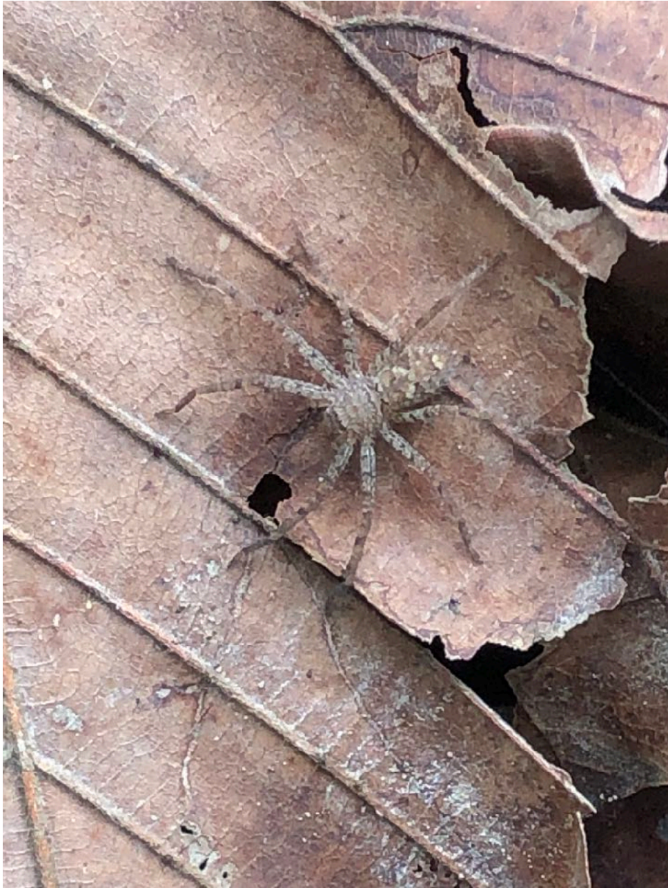
And this spider.