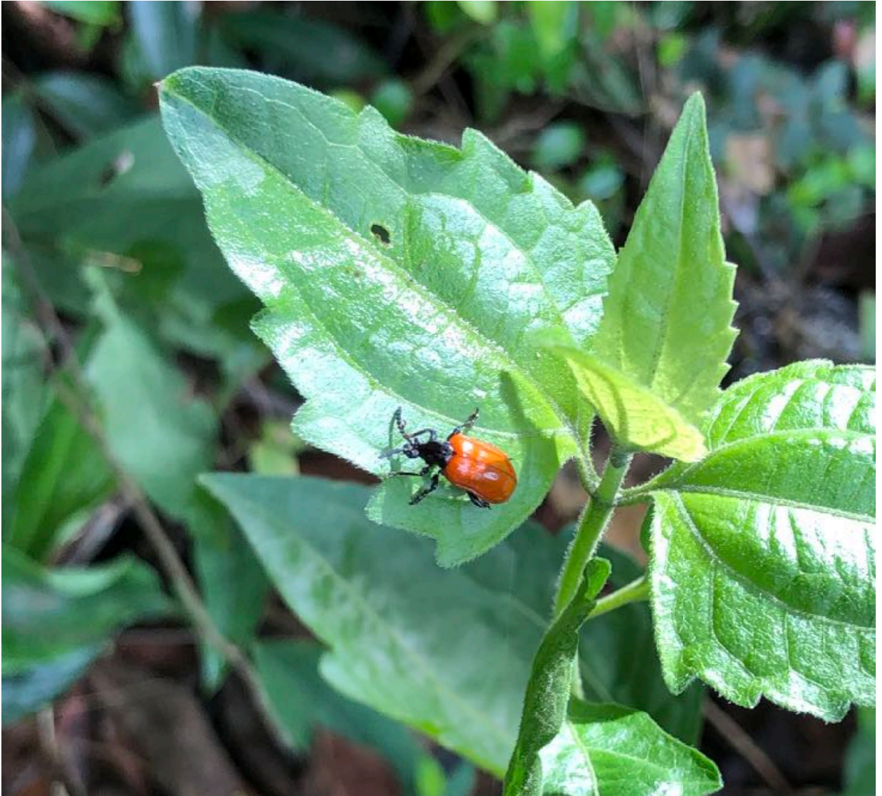
Orange “sucking” insect.