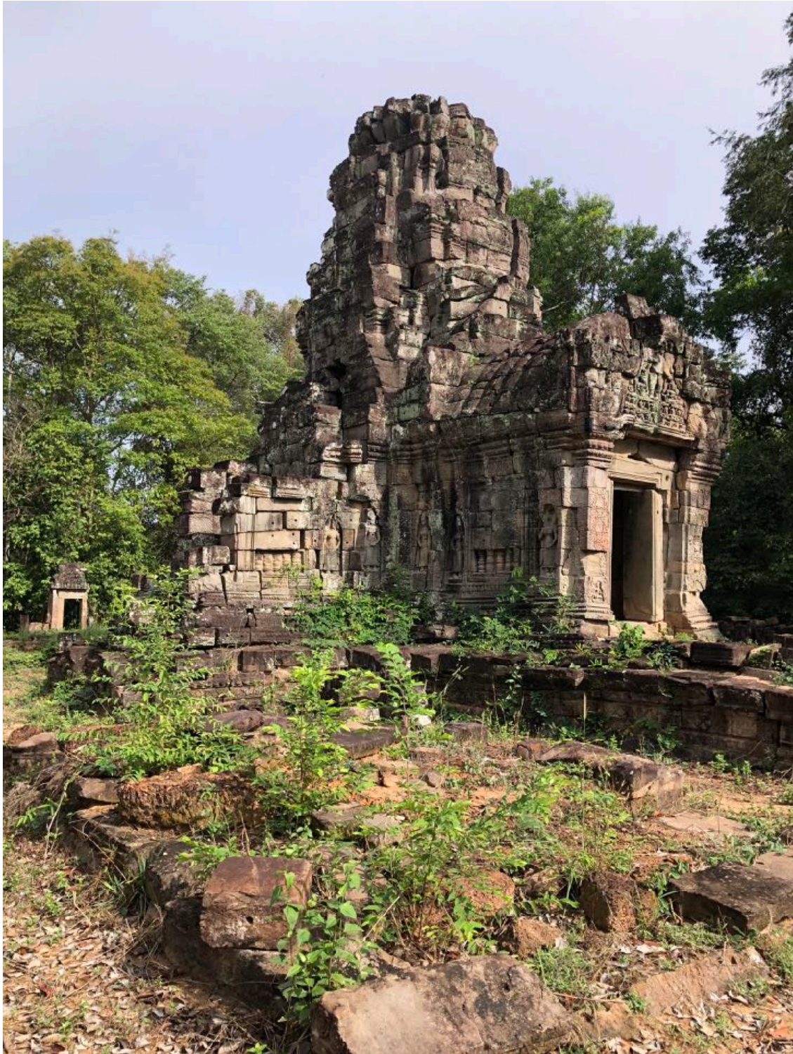
Prasat Chrung SE in the morning sun. The laterite foundations in front of the temple were once a library.