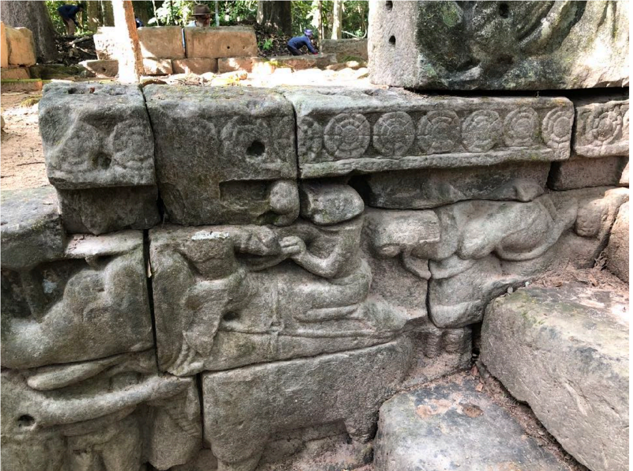
This elephant is followed by two horses.