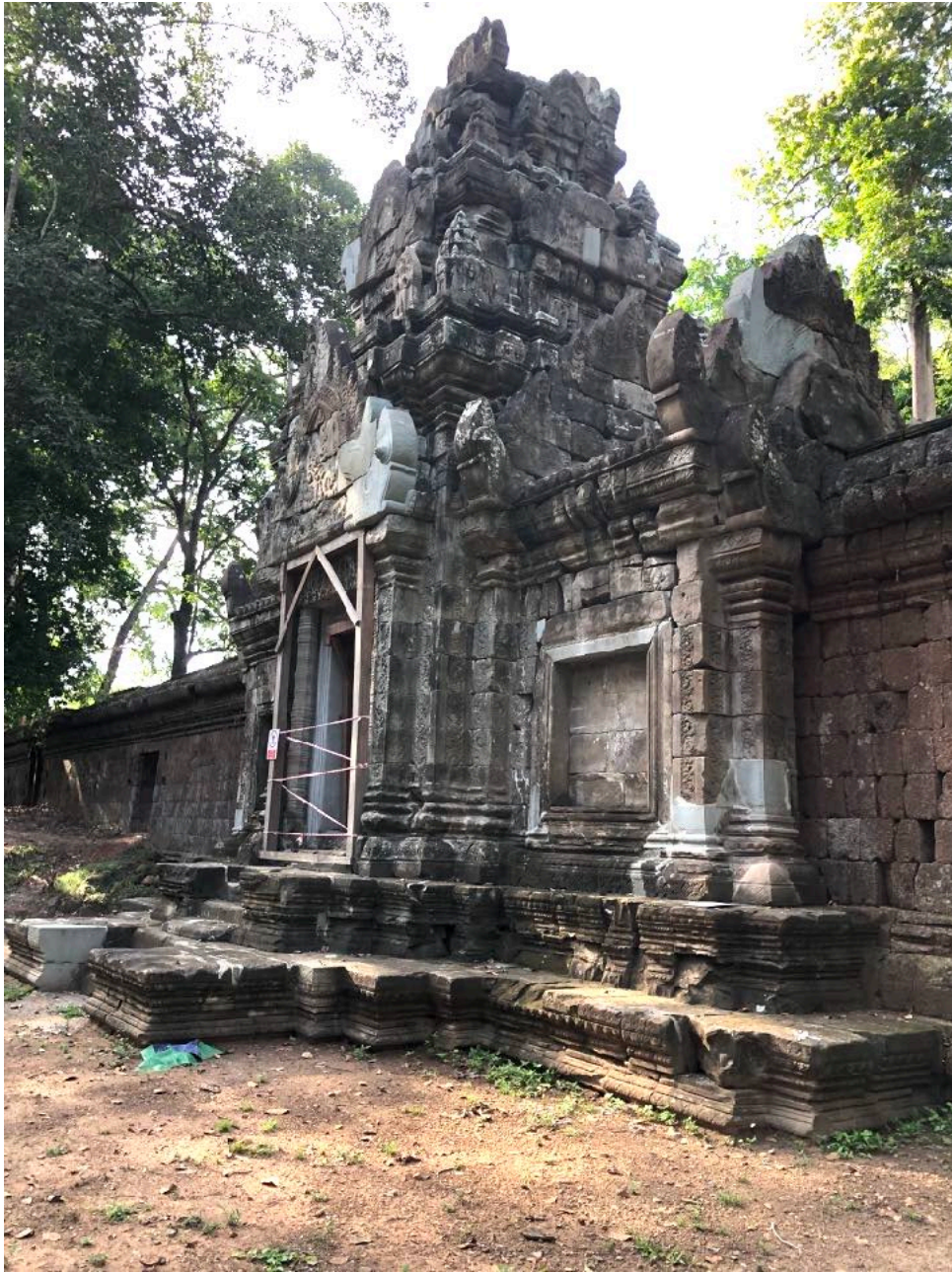
Restoration work on the second gopura in the north wall.