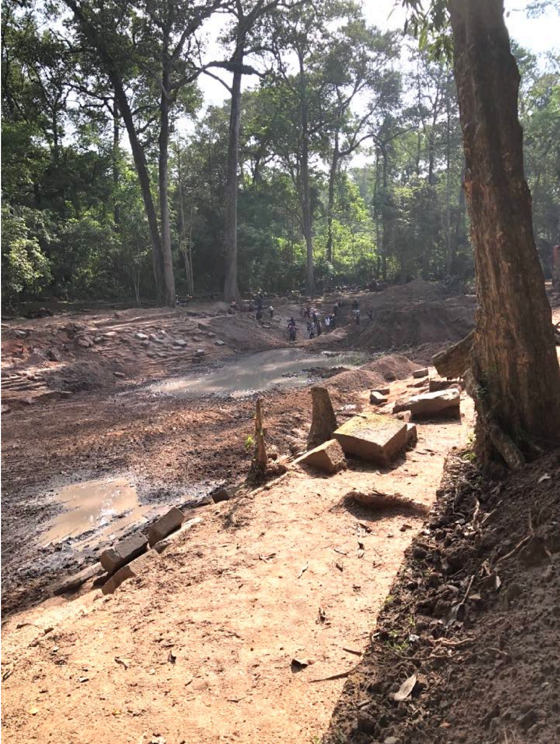
Excavation of this royal bathing pool is nearly complete.