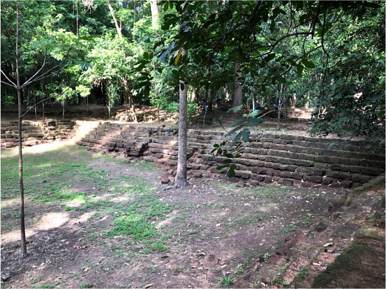
A third bathing pool, with no water.