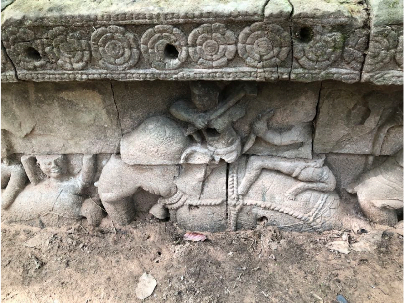
Elephant and riders.