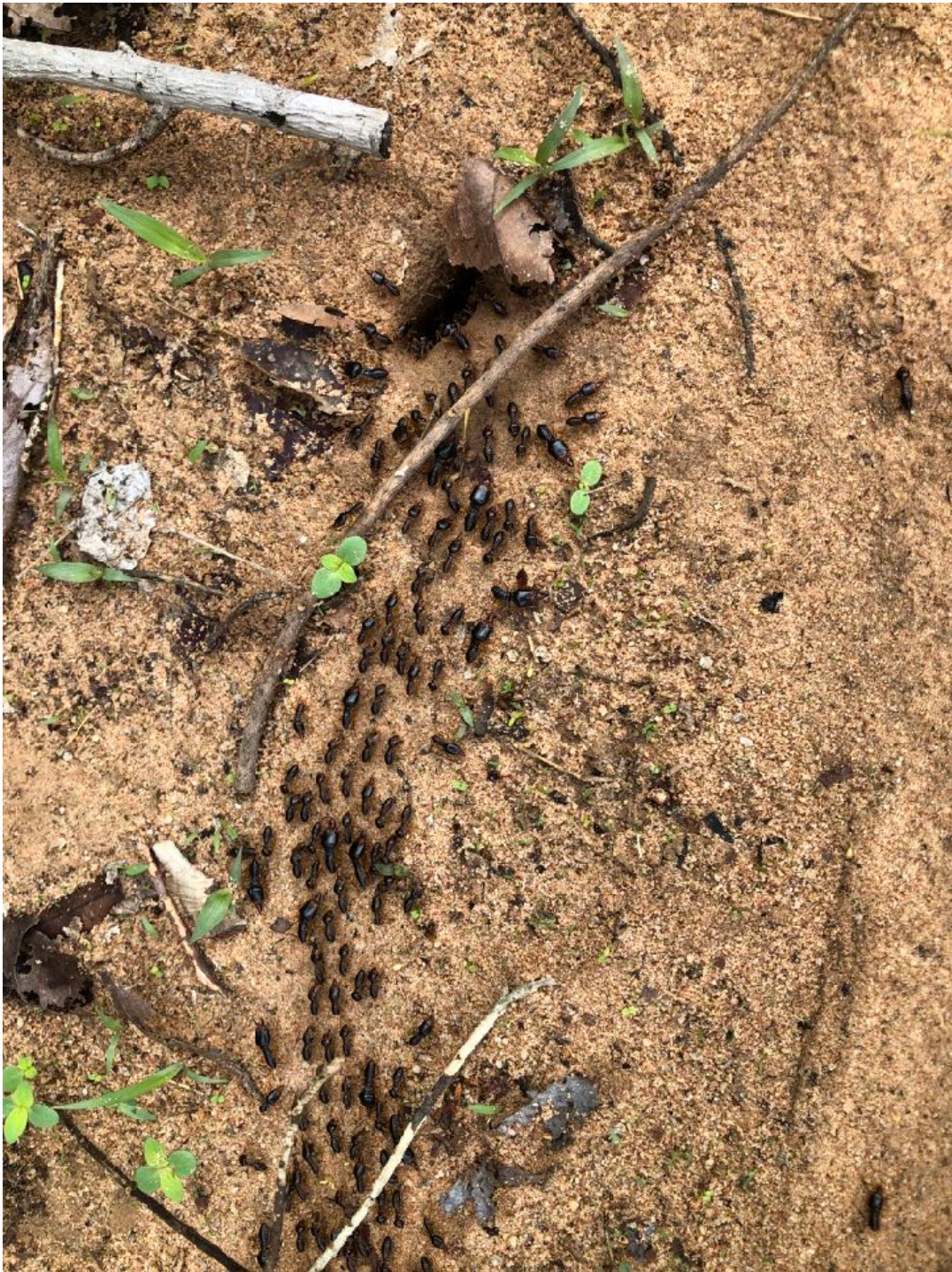
A column of termites (moving house?)