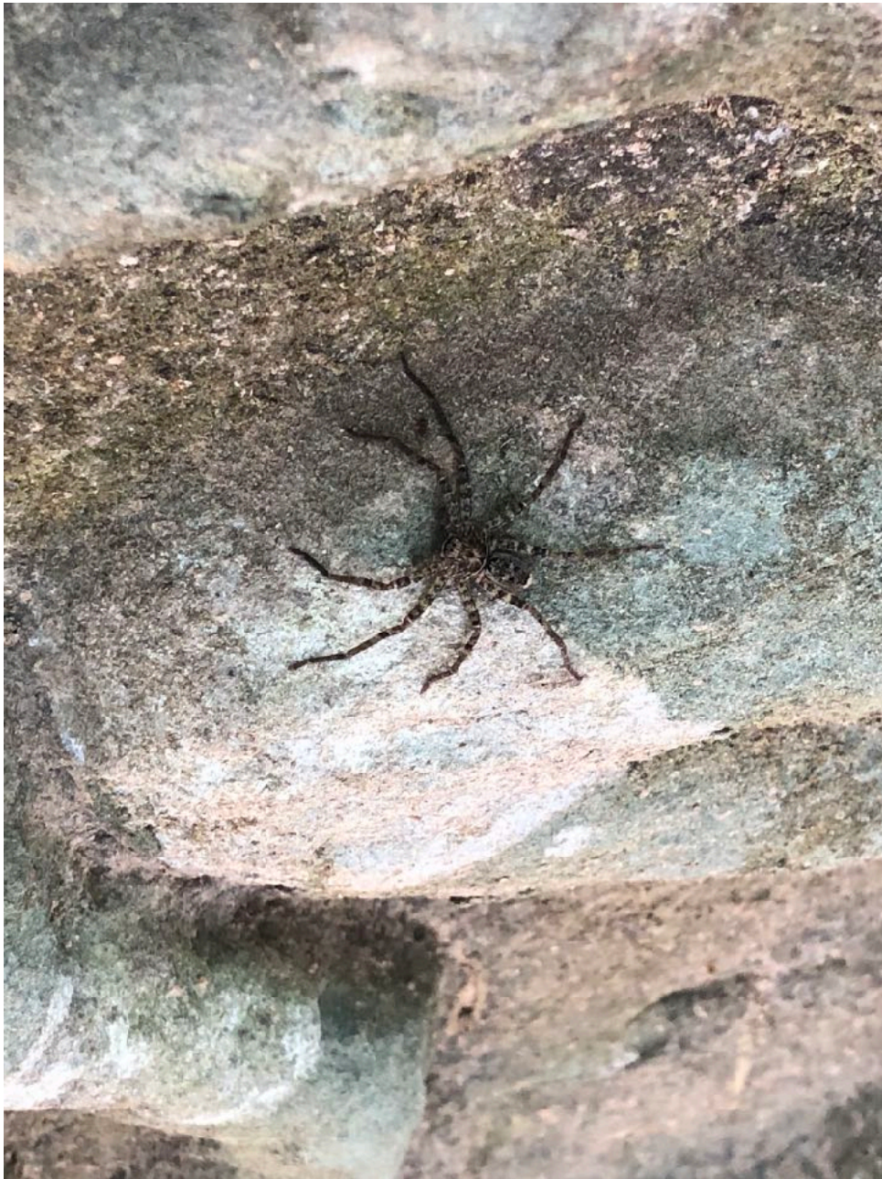
A spider on the carvings.

There is definitely more research to do and more to see in these carvings inside the Royal Palace wall.