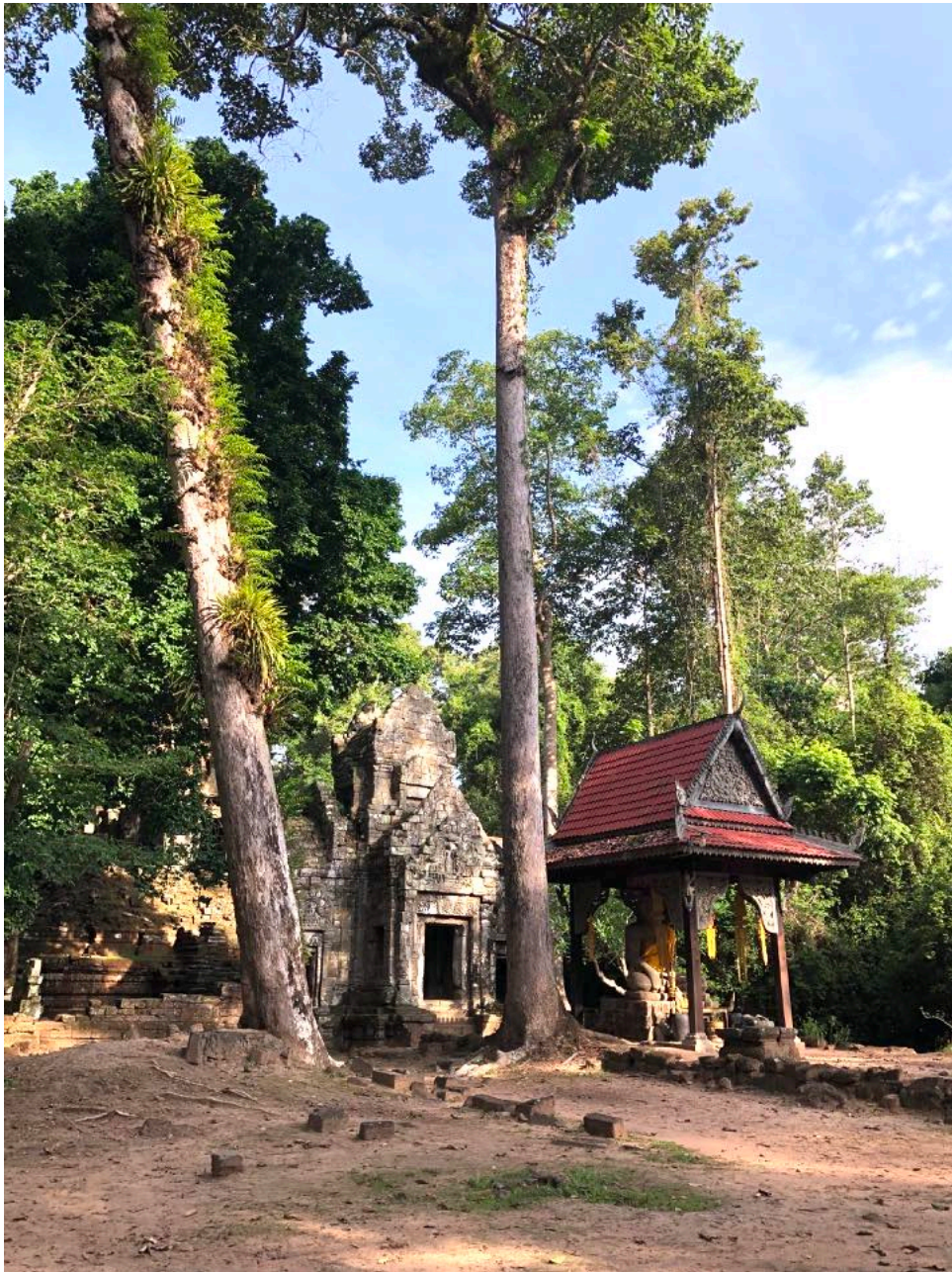
Palilay in the morning sunshine.

We are going back to Phimeanakas today, to find the carvings of the different horses. We have seen several posts about them (and so now we have to find them!)