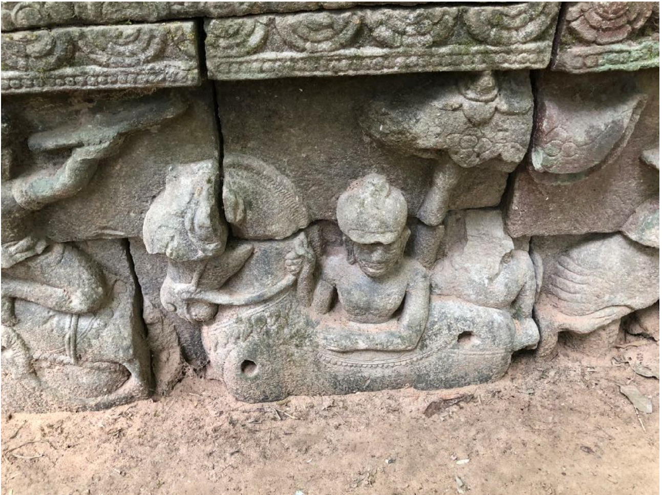
A horse and rider.

From this, I think there is more to excavate. The ground level has risen over the last 900 years or so.