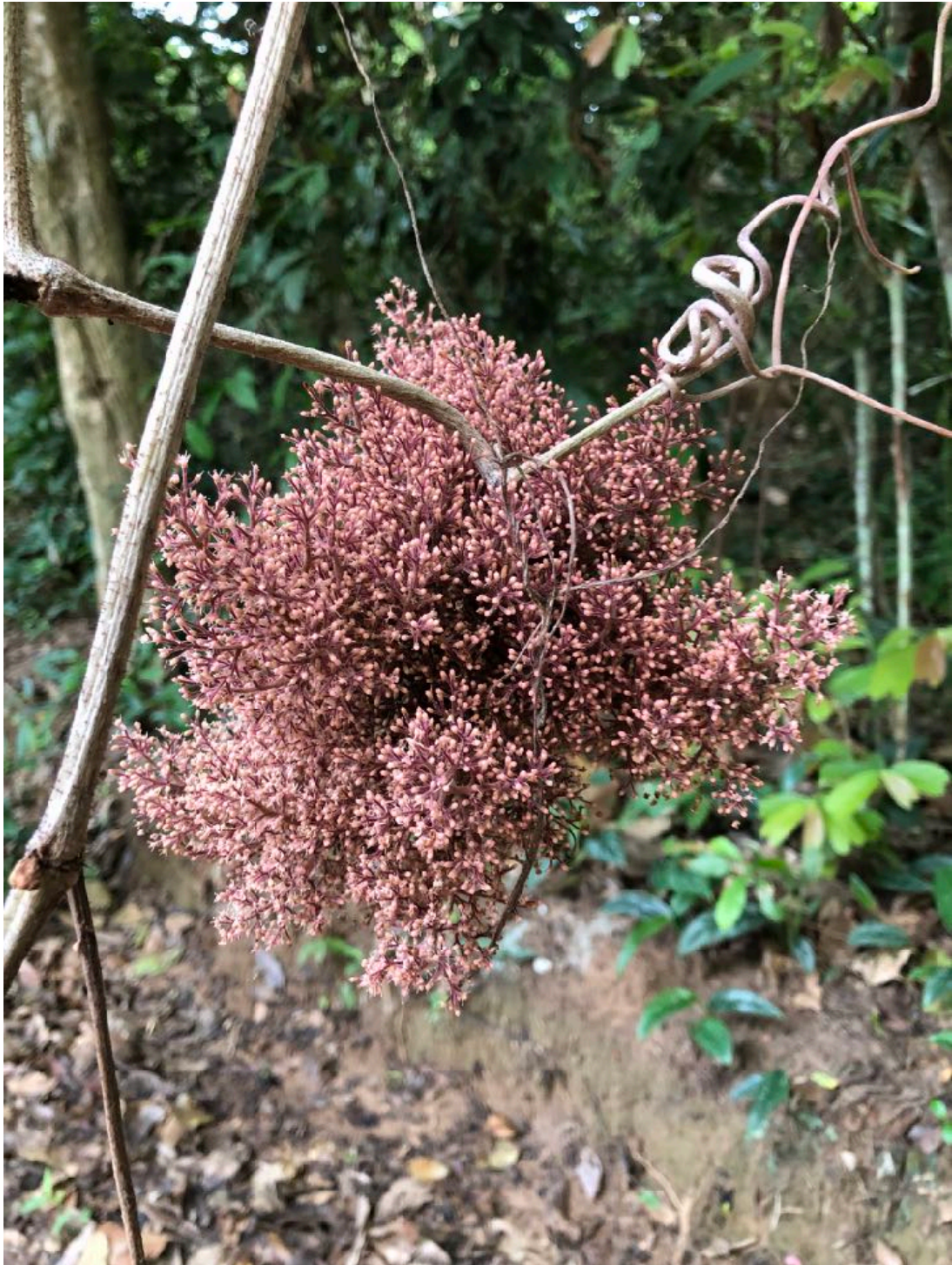
These are the flowers of the wild grapes.