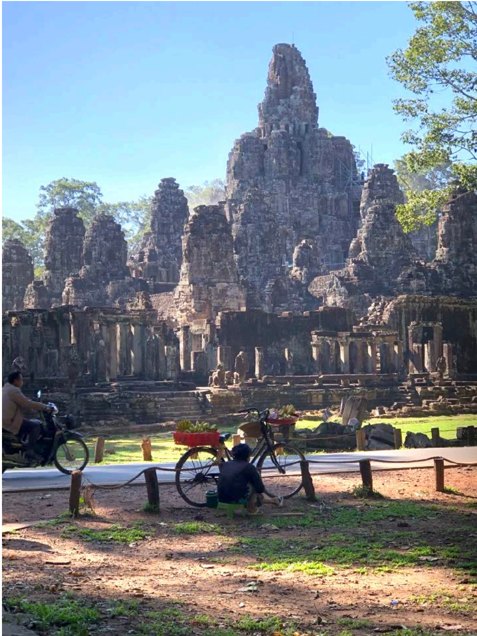
A woman selling bananas sets up roadside near the Bayon.