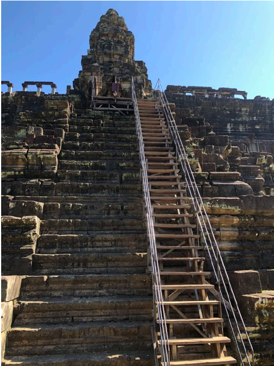
Wooden stairs built for “easy” access.