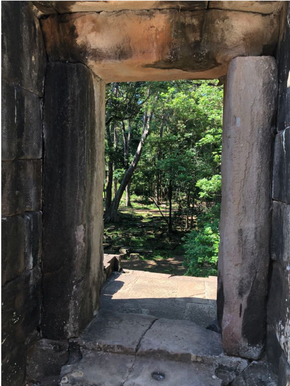
View to the south.