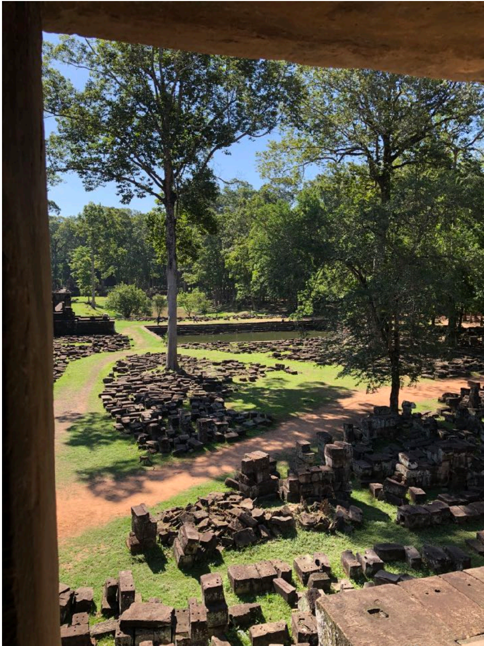
A bathing pool and blocks, seen from the first level of the temple.