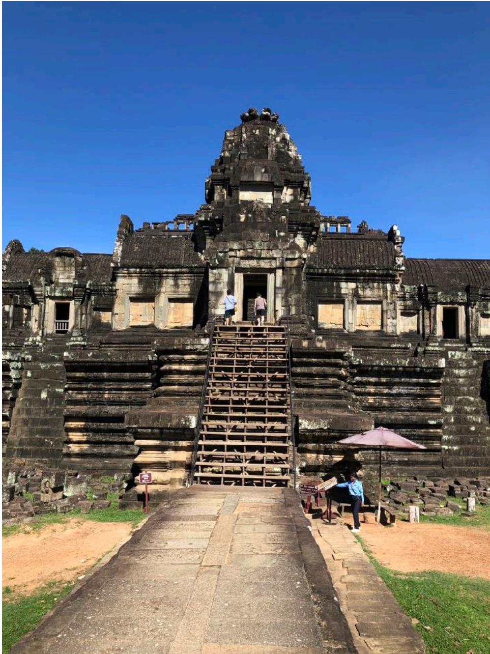
Part of the walkway and the first tier and entrance gopura on the first level of the temple.