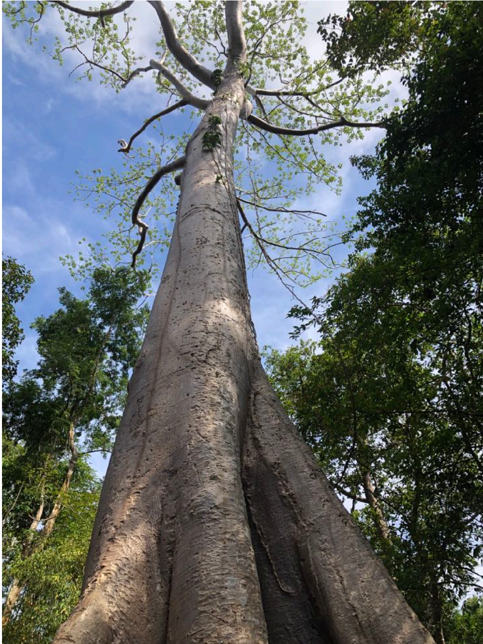
Giant “Speung” tree, at Ta Nei.