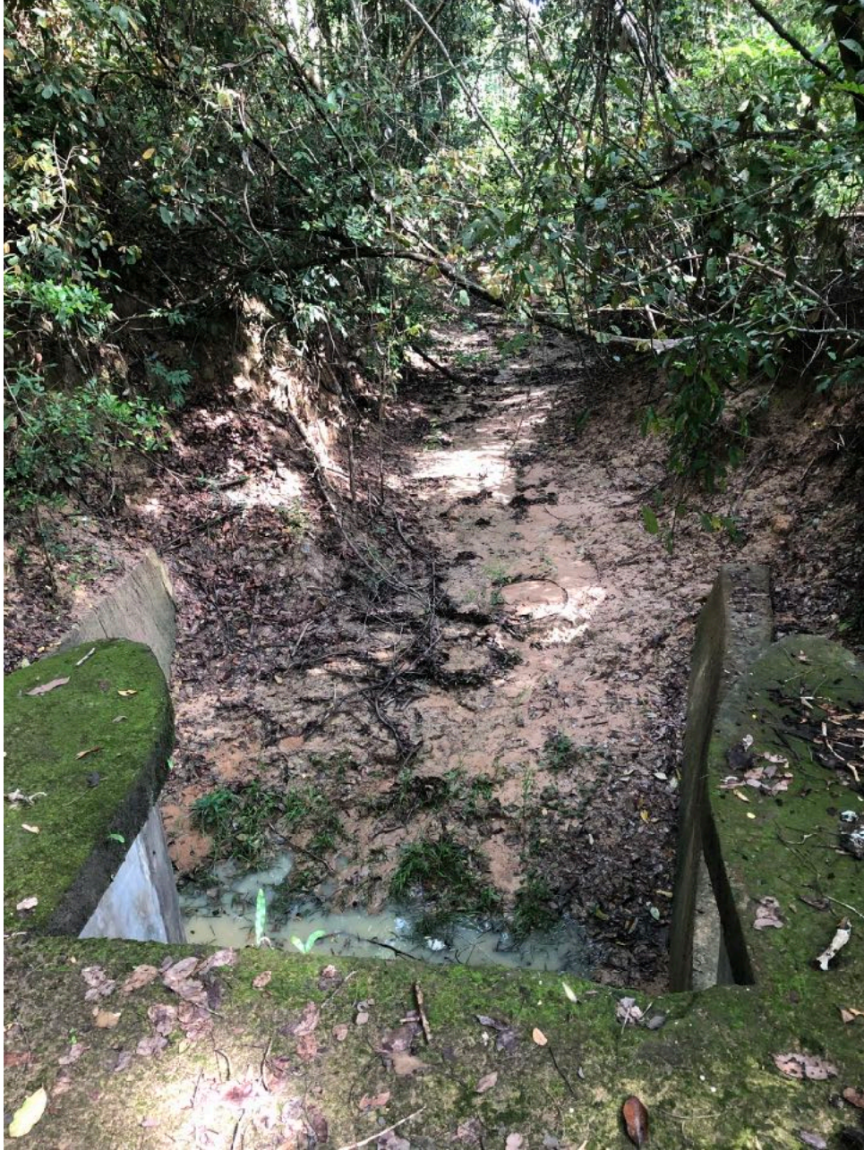
The Khmer Rouge Canal (quite over grown and not holding water).