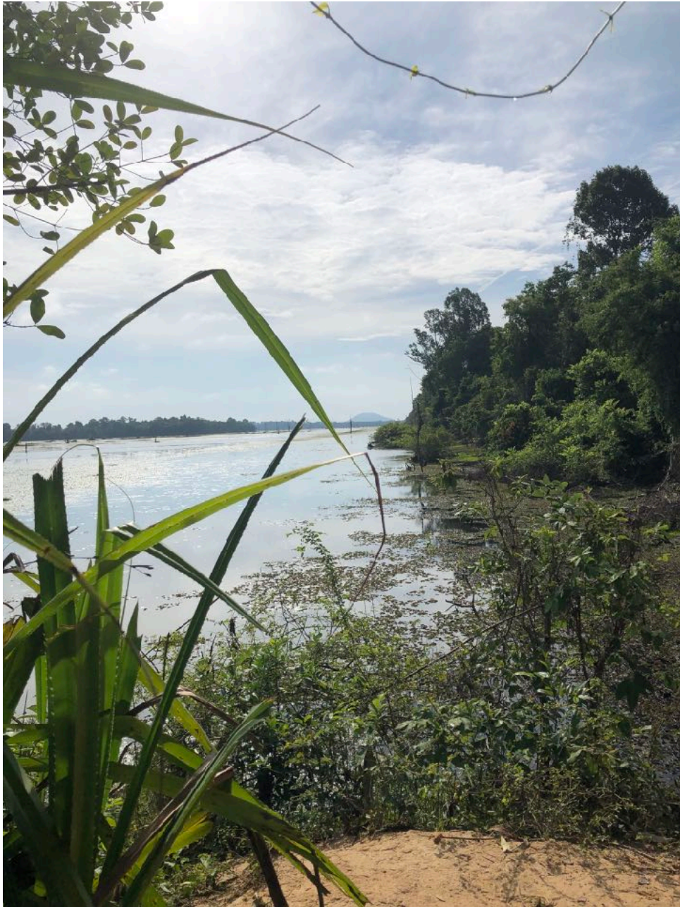
Phnom Bok and Neak Poan island in the Baray.