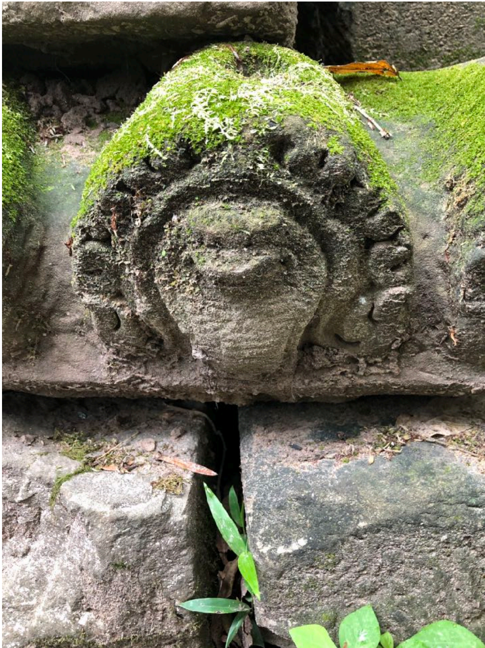
Different carved naga on these “roof tiles”.