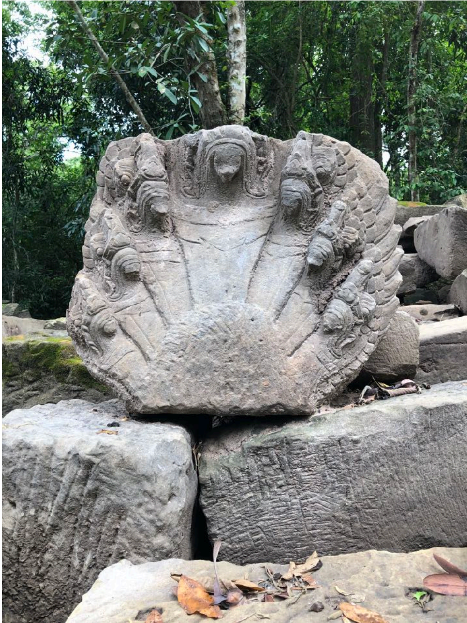
A seven headed naga... an unfinished carving.