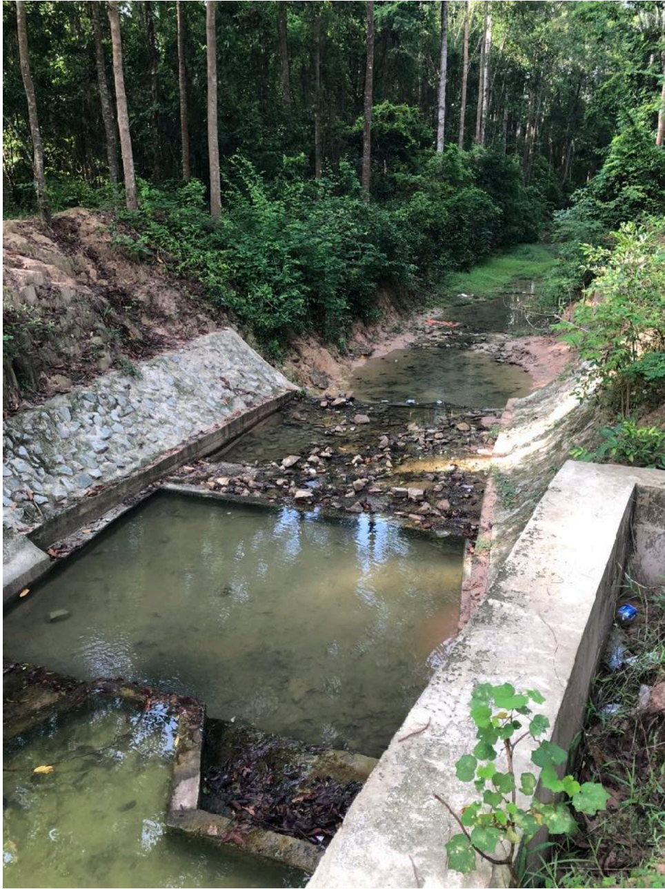
The water channel leading to a lock (feeding water from the North Baray).