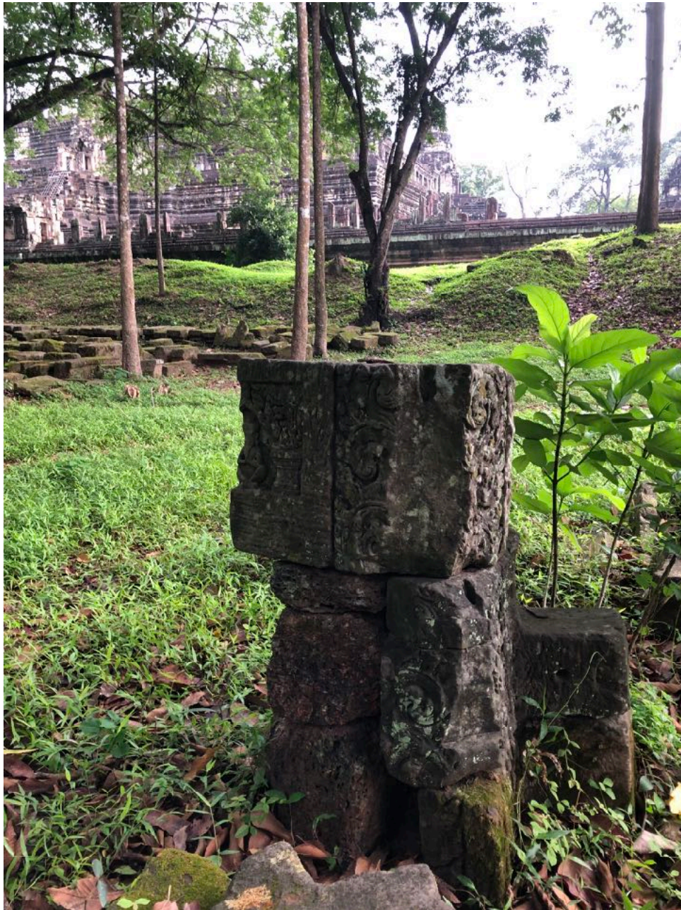
The start of the blocks with the Baphuon in the background.

Here are some photos of carvings that we found.